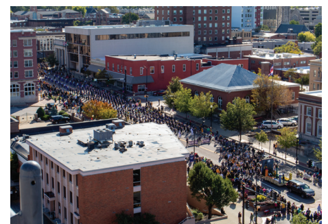
Livable and Sustainable Communities