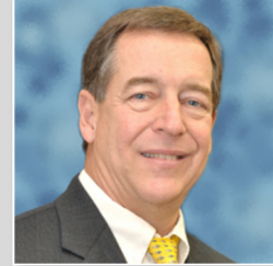
Principal Advisor Transmission & Regulatory