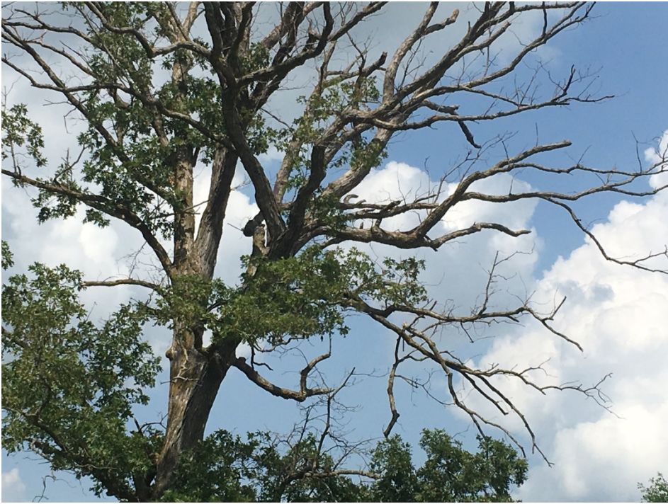
Multiple Hangers and Potential Falling Limbs