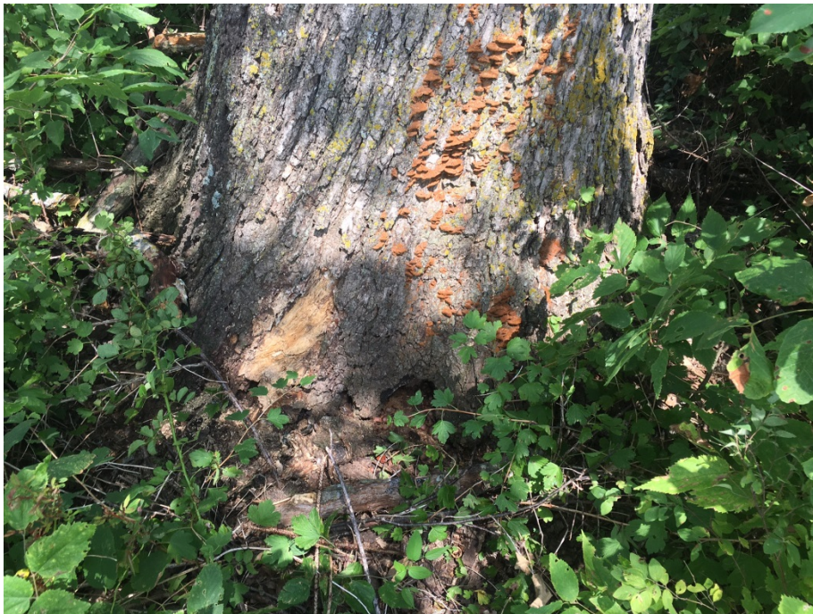
Fungus and Decay at Root Flare