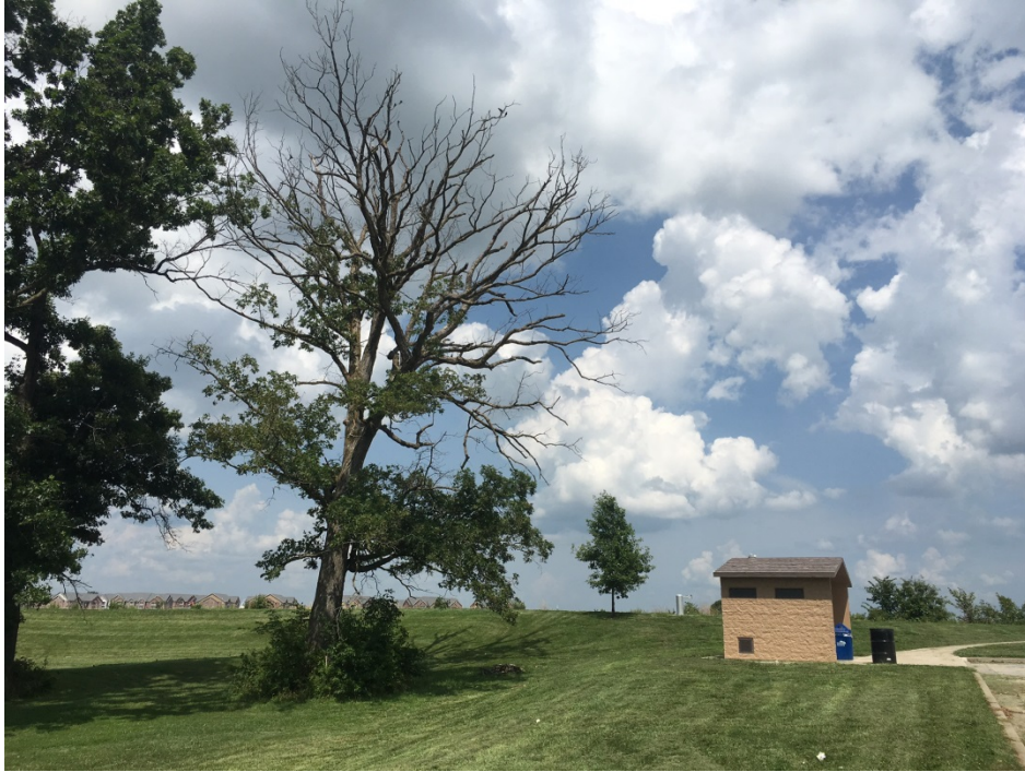
Significant Canopy Loss