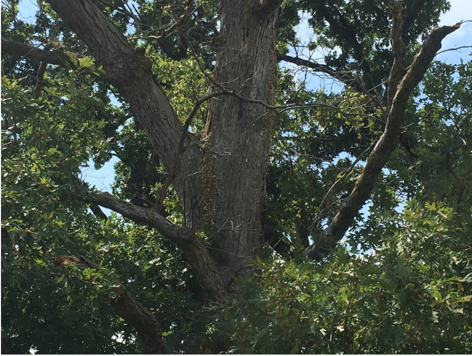
Fungus in Tree Canopy