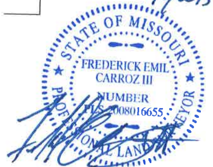
EXHIBIT "A" SHEET 2 OF 2