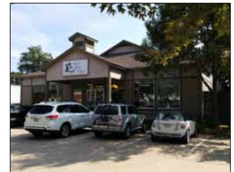
Images: Top: Small-scale office buildings provide a transition from more intensive commercial uses into residential areas, and can blend well with single-family homes.