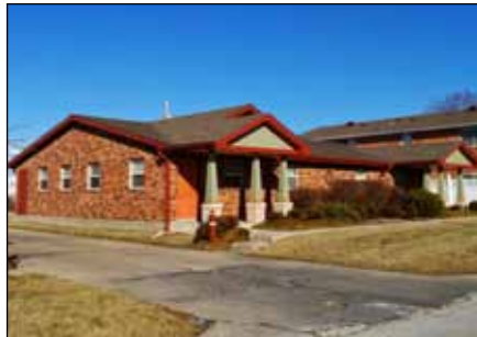
Image: The Columbia Housing Authority (CHA), as part of the renovation of its Columbia Square properties, added craftsman details to the facades of building to reflect the character of the surrounding neighborhood.

Ideas and their corresponding recommendations and implementation strategies are listed within each theme area according to the total number of votes they received from stakeholders during the prioritization phase of the planning process. The implementation strategies incorporate available programs, resources, and scheduled capital improvement items.