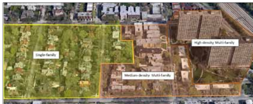
Below: A diagram of residential property transitioning in terms of density.