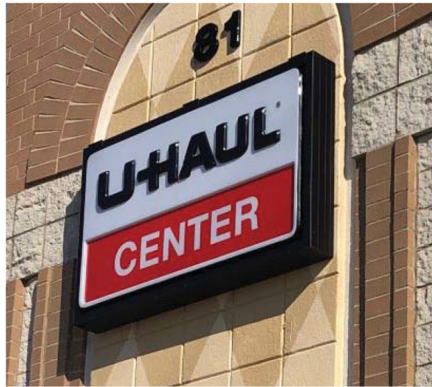
NON-LIT CABINET SIGN EXAMPLE