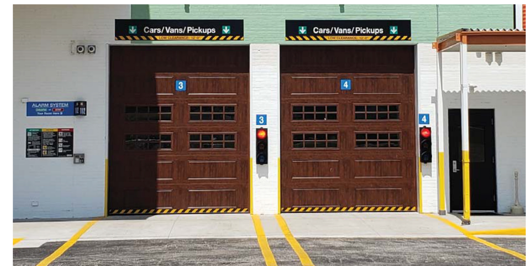
WOOD GRAIN CARRIAGE DOOR EXAMPLE

CHANGE IN PAINT TO PROVIDE ARTICULATION TO THE ELEVATION