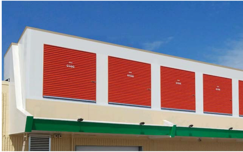
ARCHITECTURAL DETAIL EXAMPLE

CHANGE IN MATERIALS TO PROVIDE ARTICULATION TO THE ELEVATION