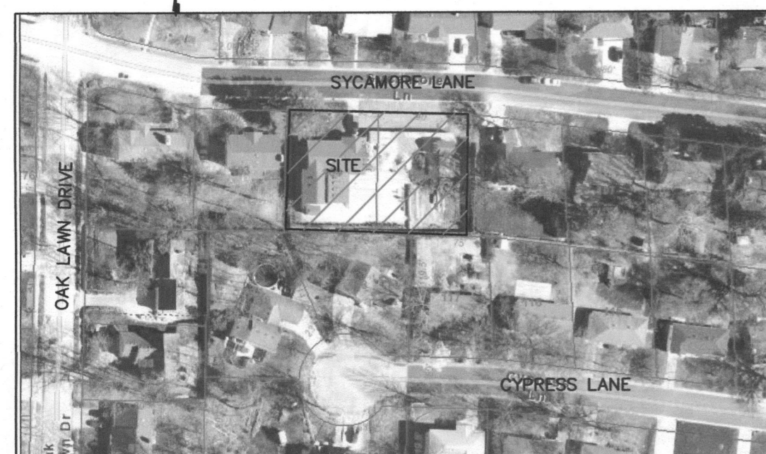
SITE LOCATION MAP NOT TO SCALE

A MINOR SUBDIVISION REPLAT OF LOT 7 AND PART OF LOT 8 OF OAKWOOD HILLS SUBDIVISION BLOCK FOUR PART OF THE NORTHEAST 1/4 OF SECTION 26, TOWNSHIP 48 NORTH, RANGE 13 WEST