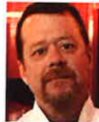
Van Hawxby DogMaster Distillery