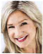
Kalle LeMone Nourish Café & Market