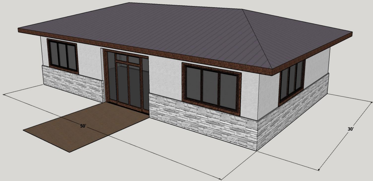
GANS CREEK RECREATION AREA RACE HEADQUARTERS BUILDING (FRONT) January 19, 2021