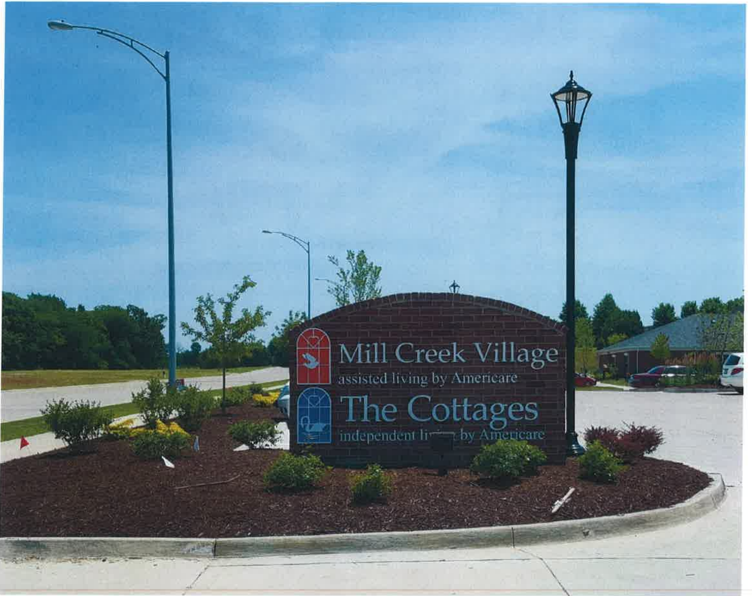
EXISTING SIGN "A"