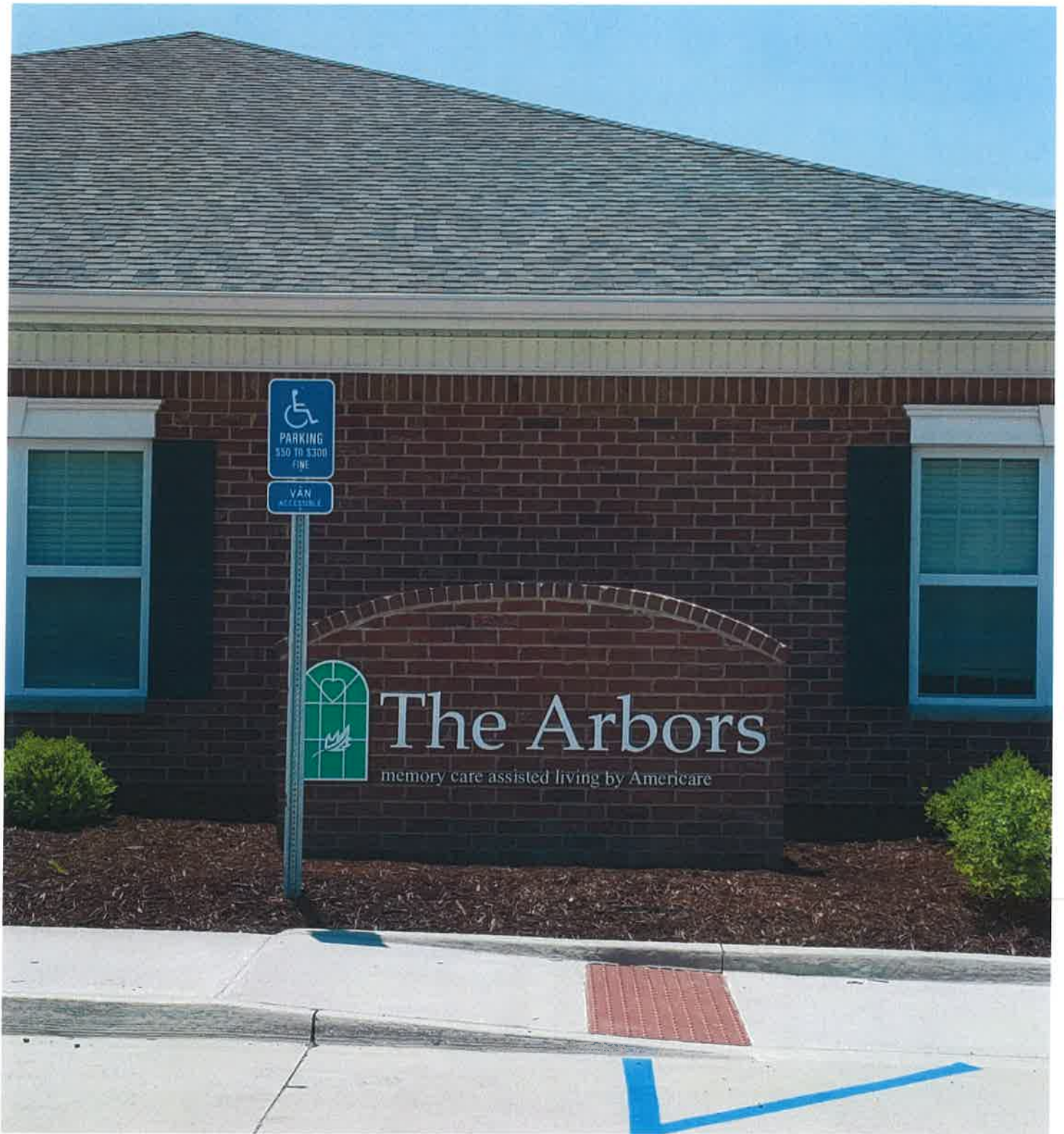
EXISTING SIGN "B"