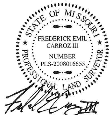
EXHIBIT "A" SHEET 1 OF 2