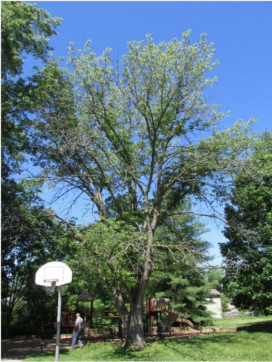
Tree Canopy – Leaf