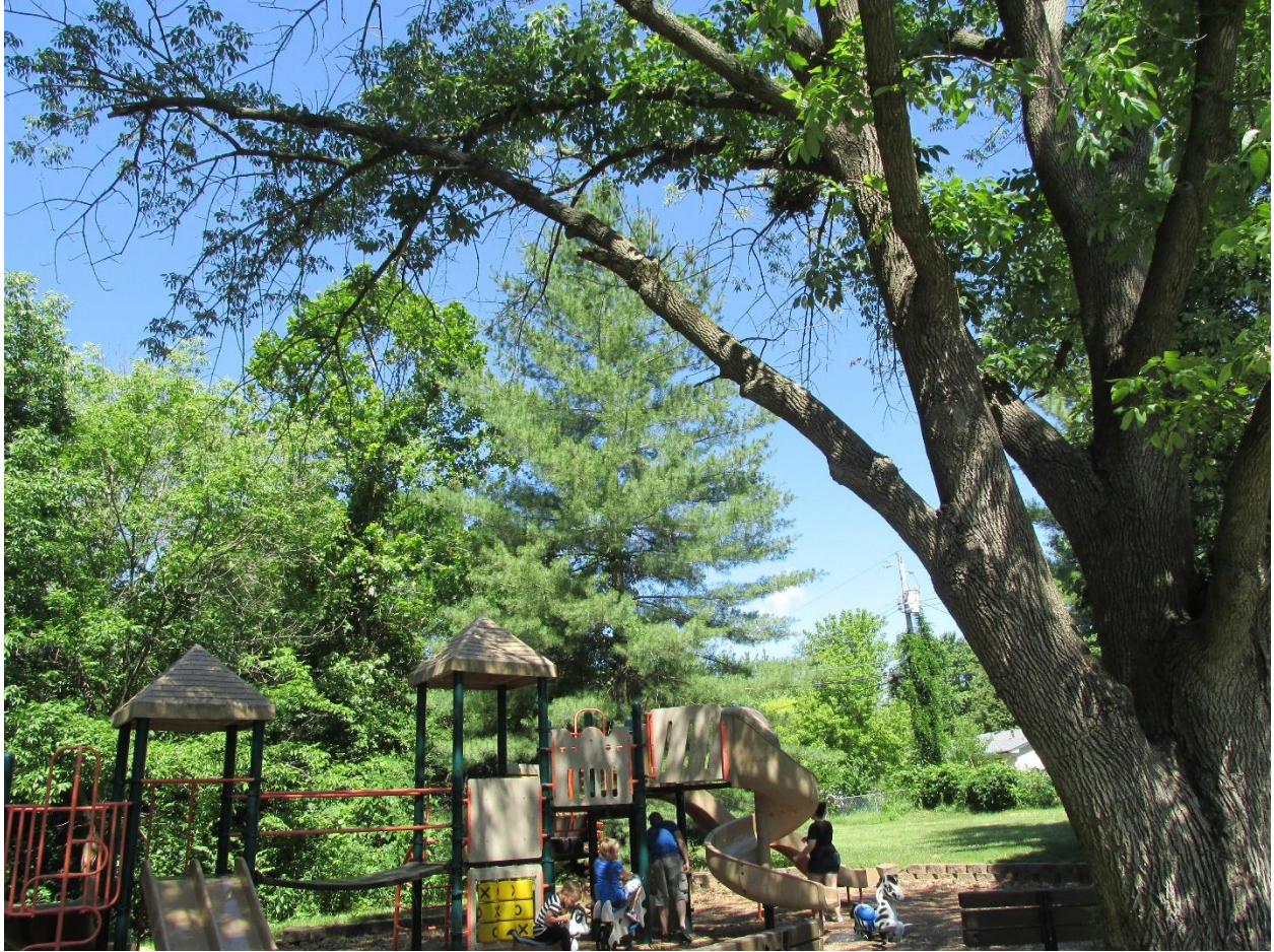
Limbs over Playground