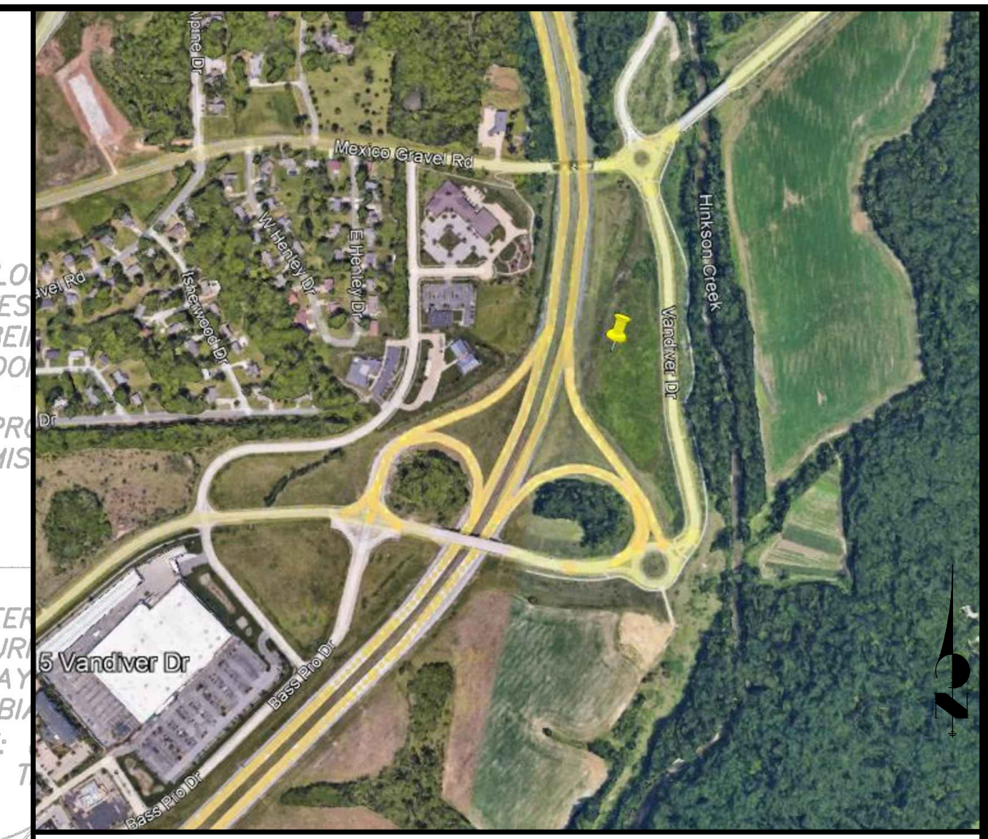
SITE AERIAL SCALE: N.T.S.