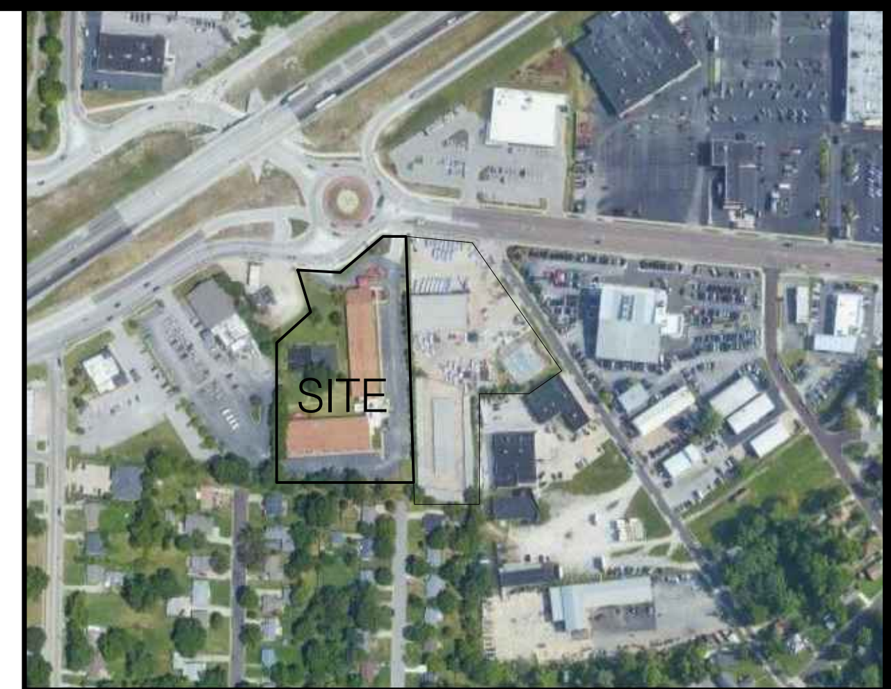
SITE SCALE: NTS

Zoning Information Project Name: U-Haul Moving & Storage at University of Missouri Municipality: City of Columbia Project Address: 900 I-70 Dr Southwest Columbia, MO Site Acre / Land Area: 3.41 acres Zone: MC (Mixed-Use Corridor)