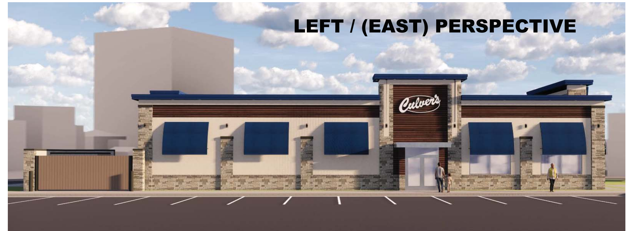
LEFT / (EAST) PERSPECTIVE