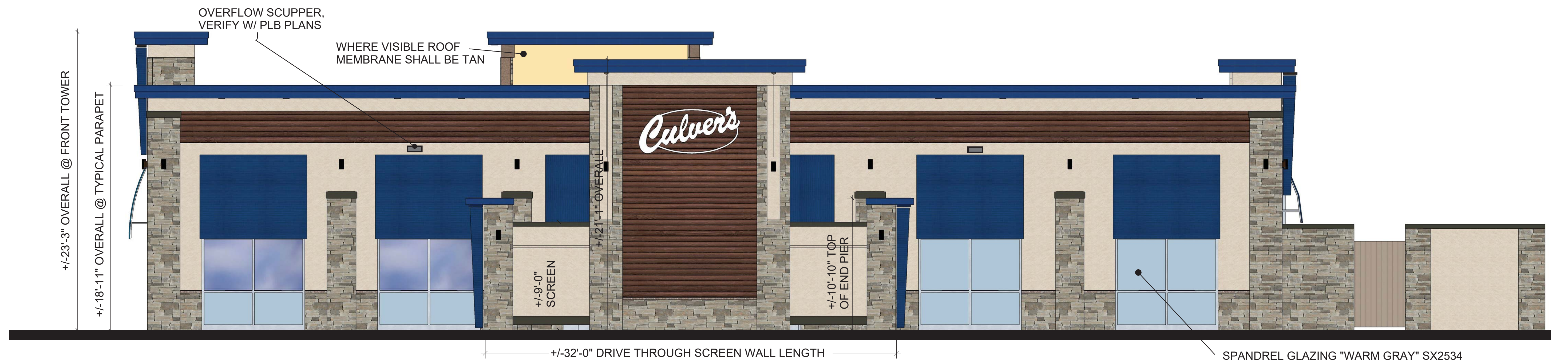
WEST / DRIVE THRU ELEVATION