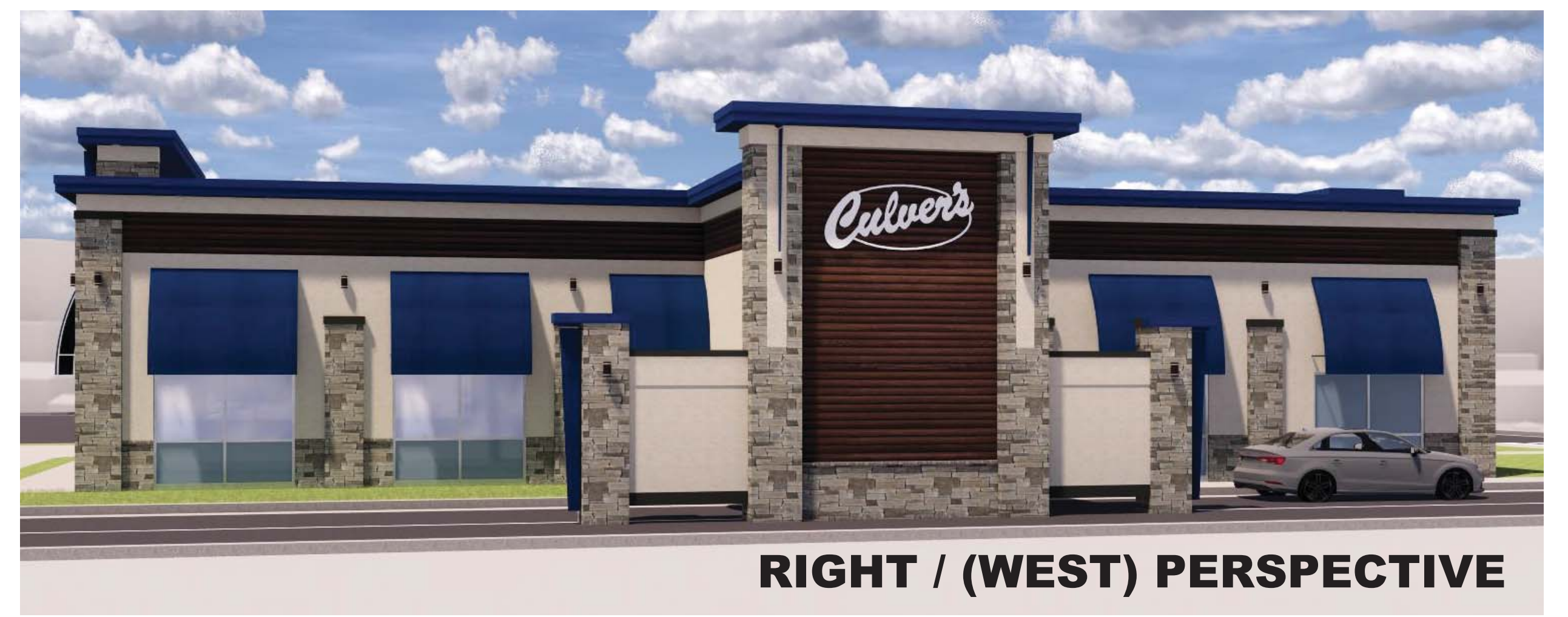
RIGHT / (WEST) PERSPECTIVE