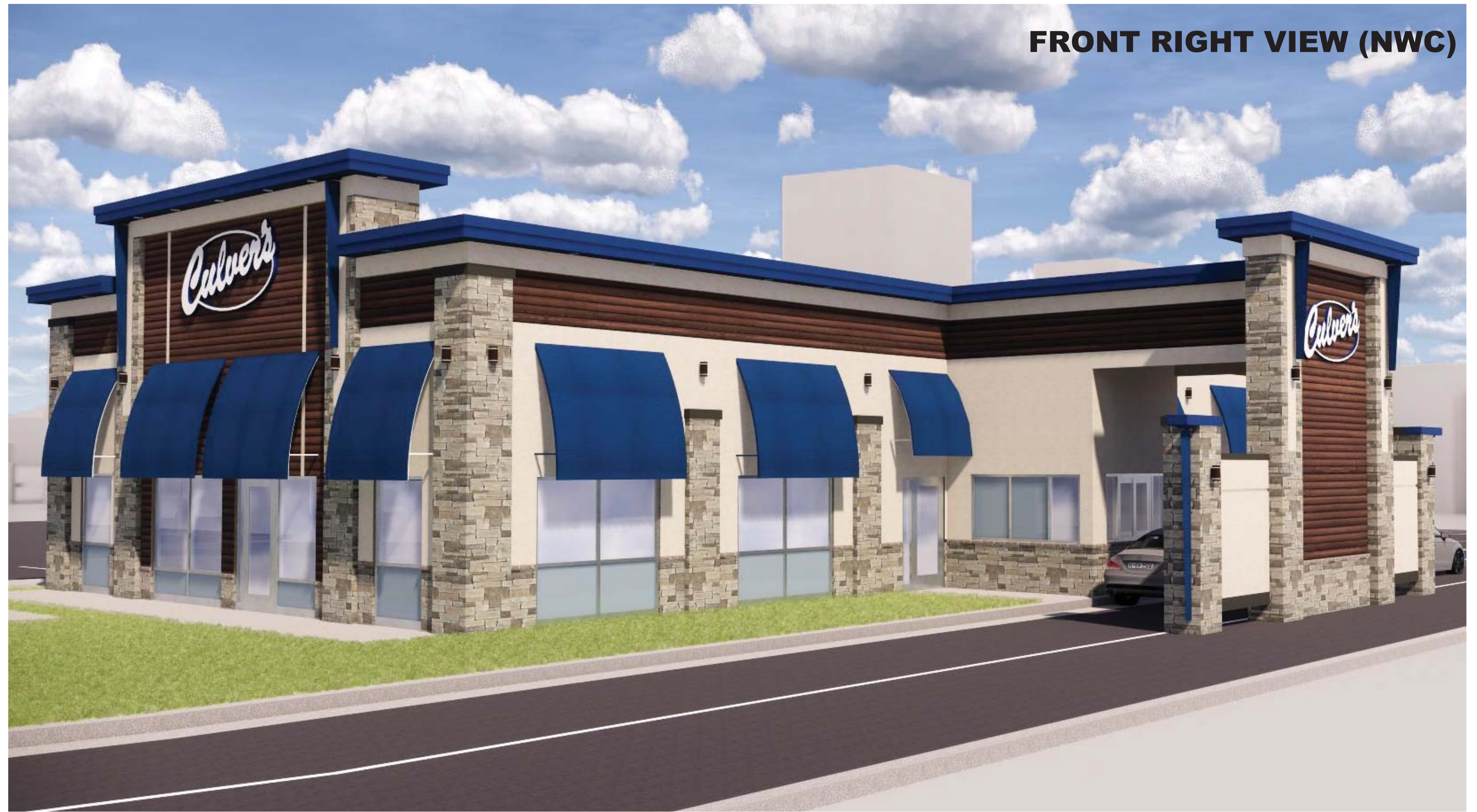
FRONT RIGHT VIEW (NWC)