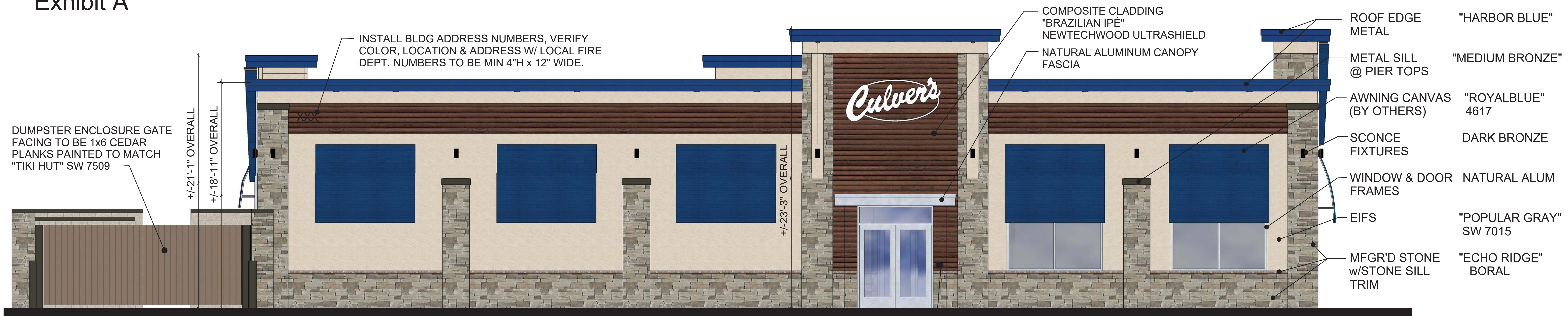
EAST / MAIN ENTRY ELEVATION