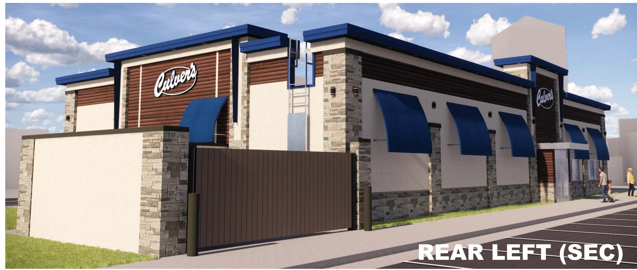
REAR LEFT (SEC)