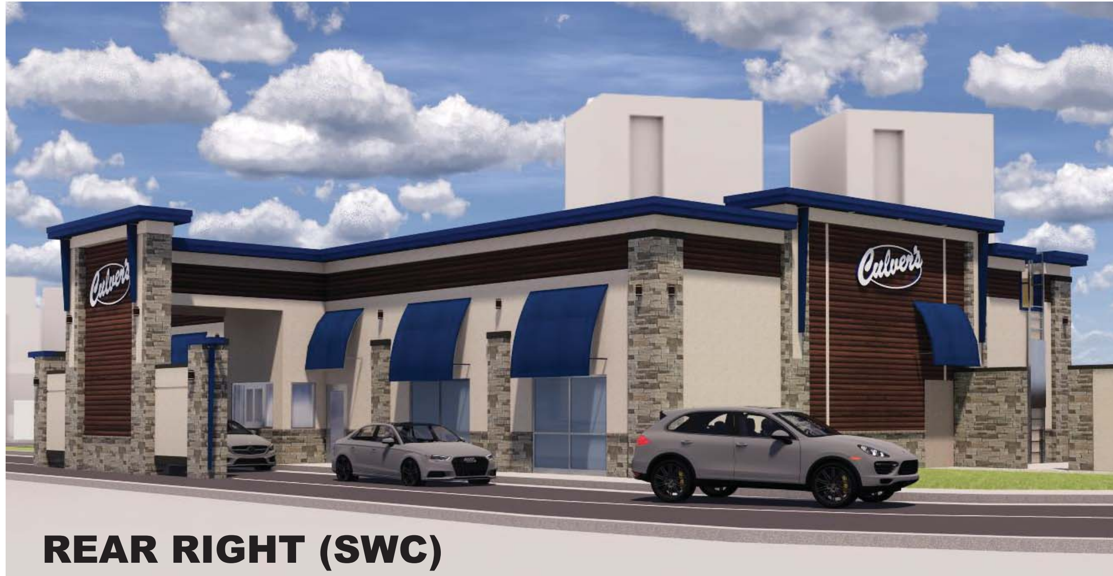
REAR RIGHT (SWC)