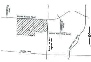
SCALE: NOT TO SCALE

FLOODPLAIN NOTE THIS PROPERTY IS LOCATED IN ZONES "AE", "AF", "AO" (FLOODPLAIN), "C-1" AND "C-2" AREAS DETERMINED TO BE OUTSIDE THE 0.2 ANNUAL CHANCE FLOODPLAIN AS SHOWN BY FLOOD INSURANCE RATE MAP NUMBERS DOWNSHORE AND DOWNGRIDS BOTH DATED MARCH 17, 2011.