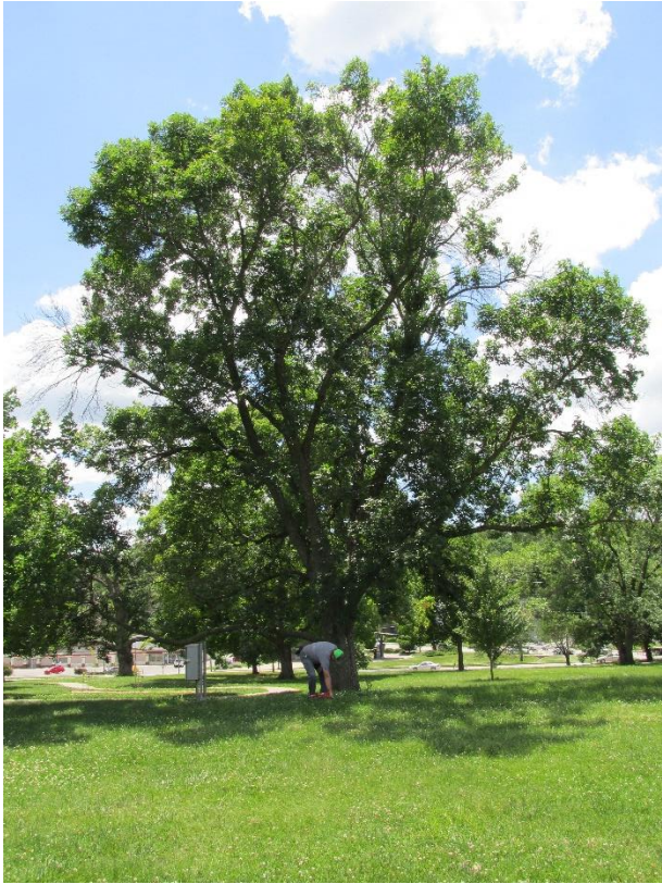
Tree Canopy – Leaf