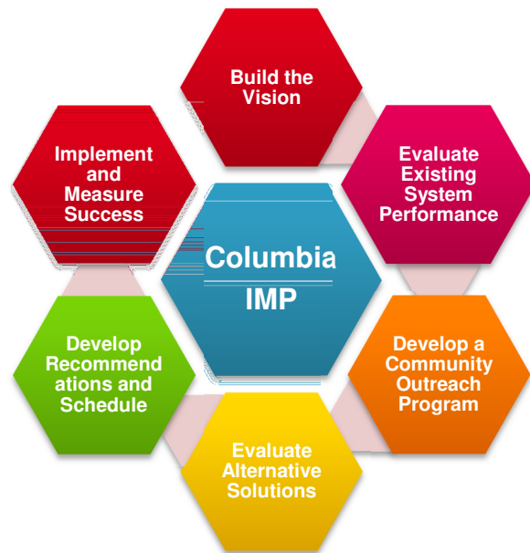
Columbia IMP Project Approach

The City envisions building the IMP in a phased manner to address the most critical existing infrastructure and regulatory drivers first, while allowing adequate time to gather the information needed for thoughtful infrastructure planning. The City believes that this tailored approach will lead to the development of an adaptable IMP that addresses current regulatory drivers, provides investment certainty over the next 5-10 years, accounts for necessary non-regulatory investments prior to taking on investments to deal with future drivers, and defines affordability for the City's ratepayers and financial capability for the wastewater and stormwater utilities.