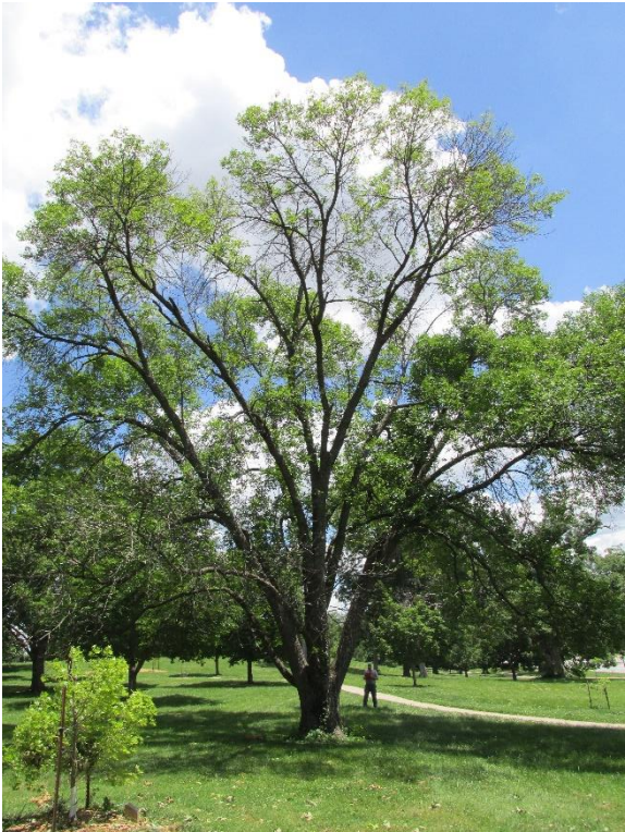
Tree Canopy – Leaf