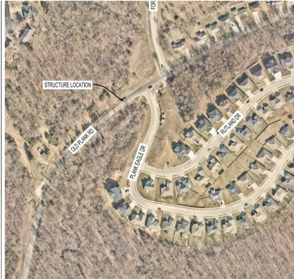
Exhibit A - Location of Project