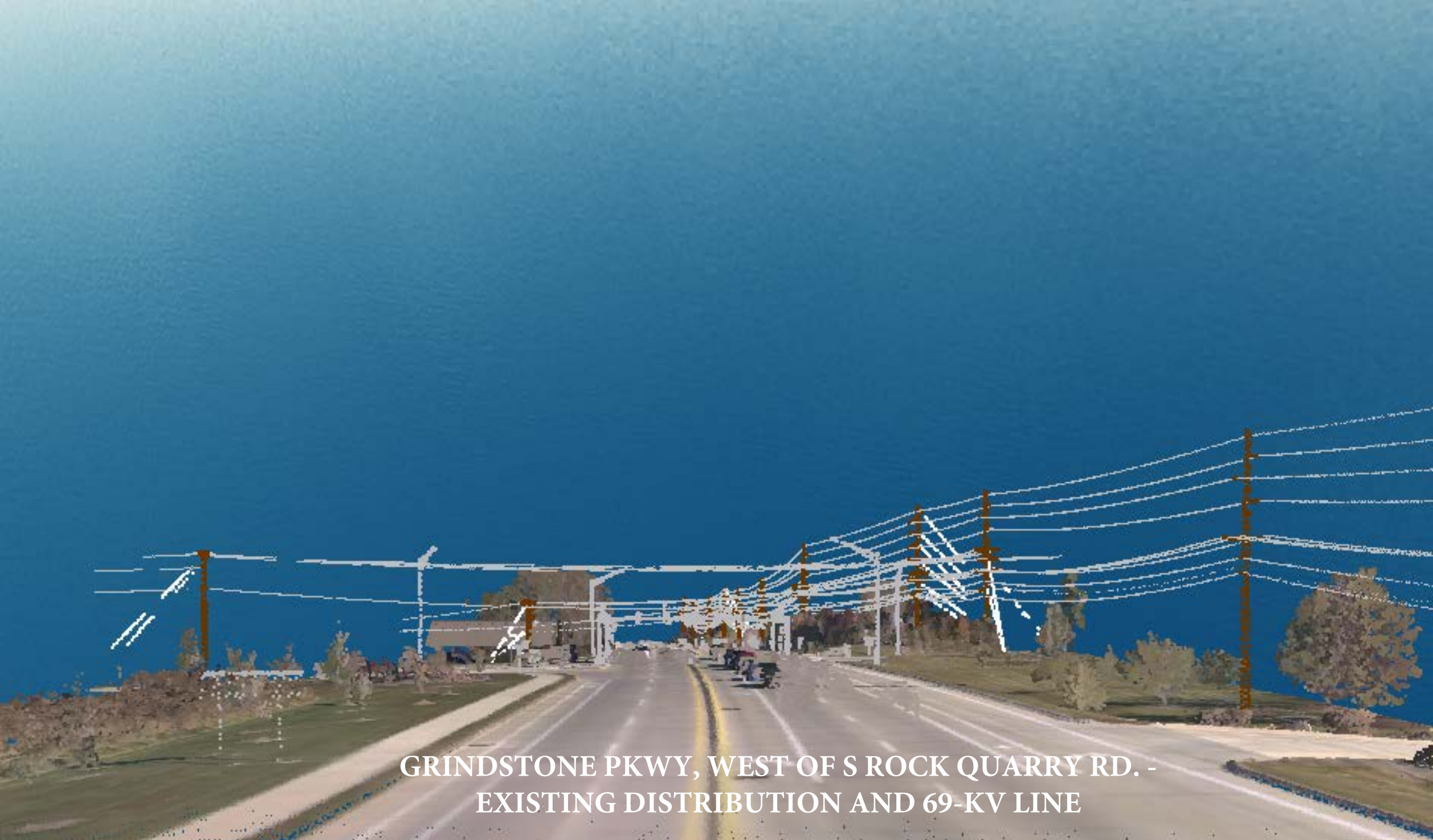
GRINDSTONE PKWY, WEST OF S ROCK QUARRY RD. - EXISTING DISTRIBUTION AND 69-KV LINE