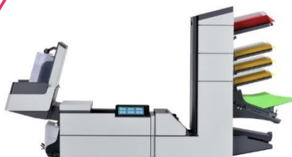
Sealers & Inserting Systems