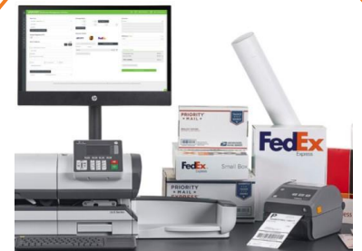
Package Shipping Systems