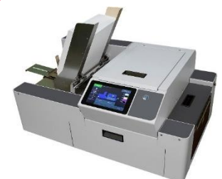
Document & Envelope Printers