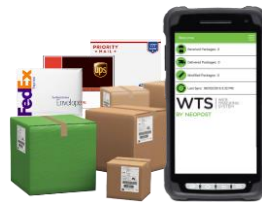
Package Receiving & Tracking Systems