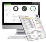
Document Enhancement Software