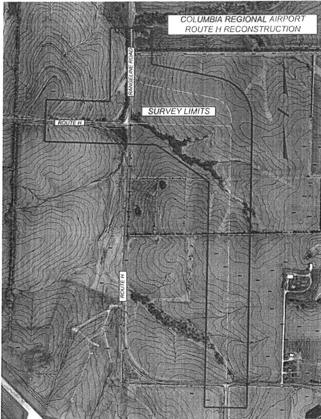
Exhibit No. 1 Route H – General Location