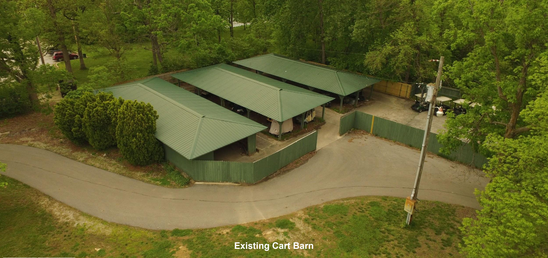
Existing Cart Barn