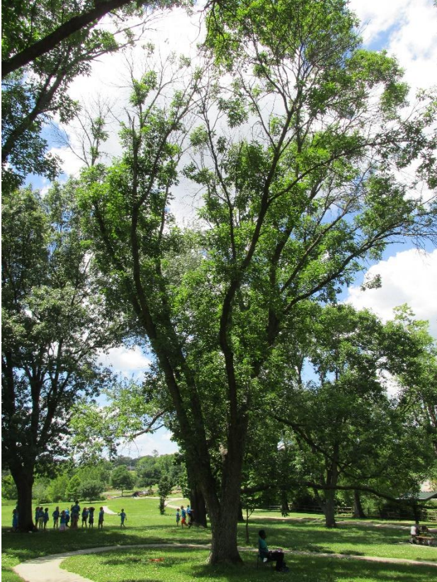
Tree Canopy – Leaf