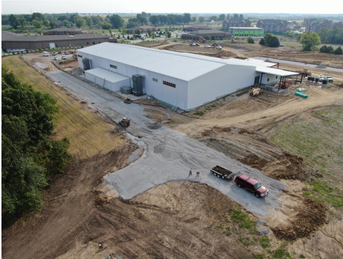
Grading and Rock for North roadway