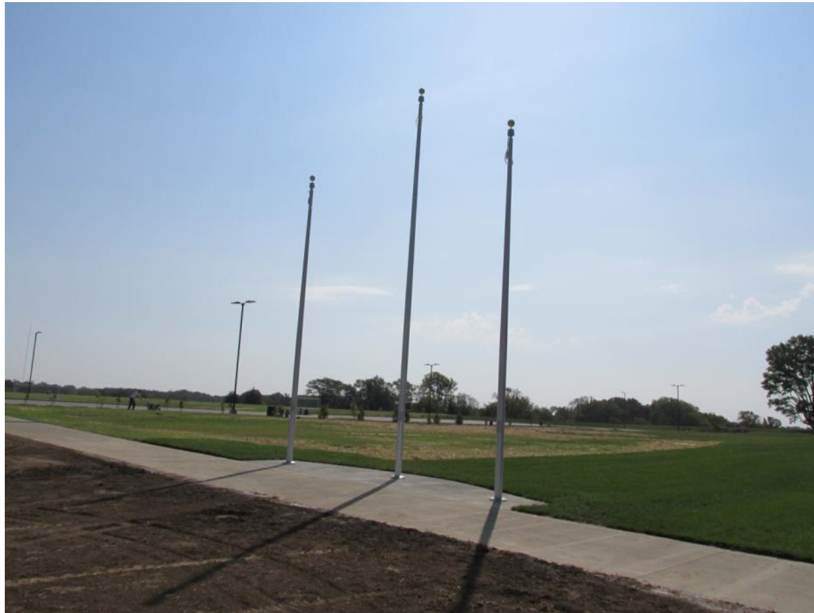
Flag Pole Installation