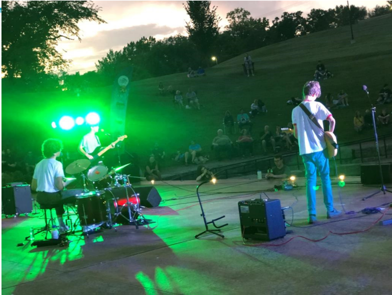
Darkroom Records (CPS students)