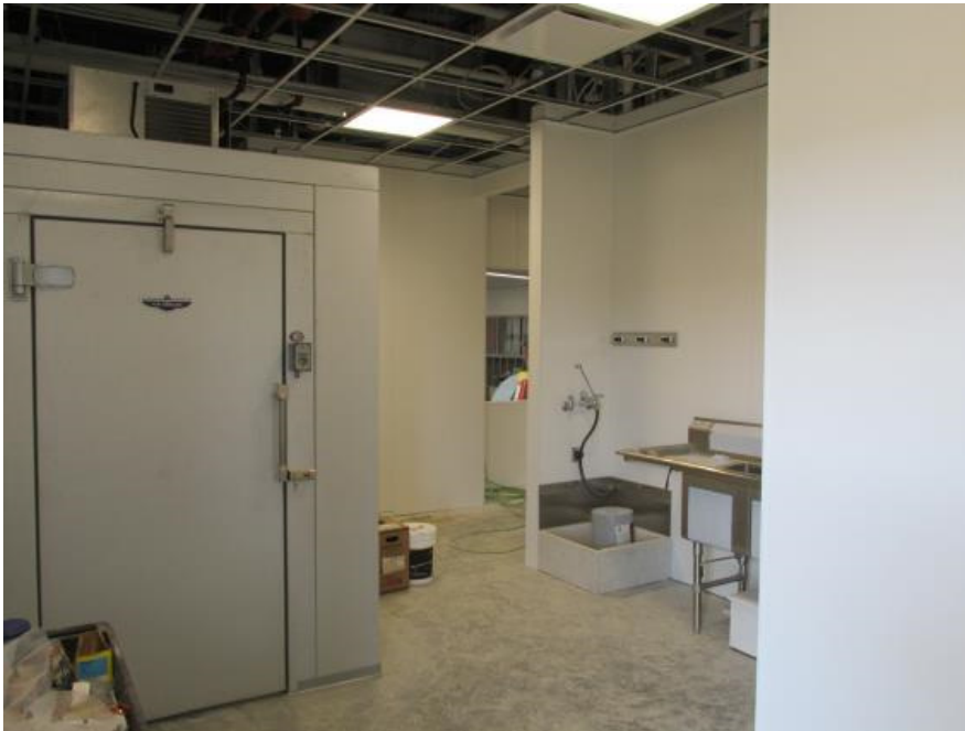
Restroom and Concession Construction