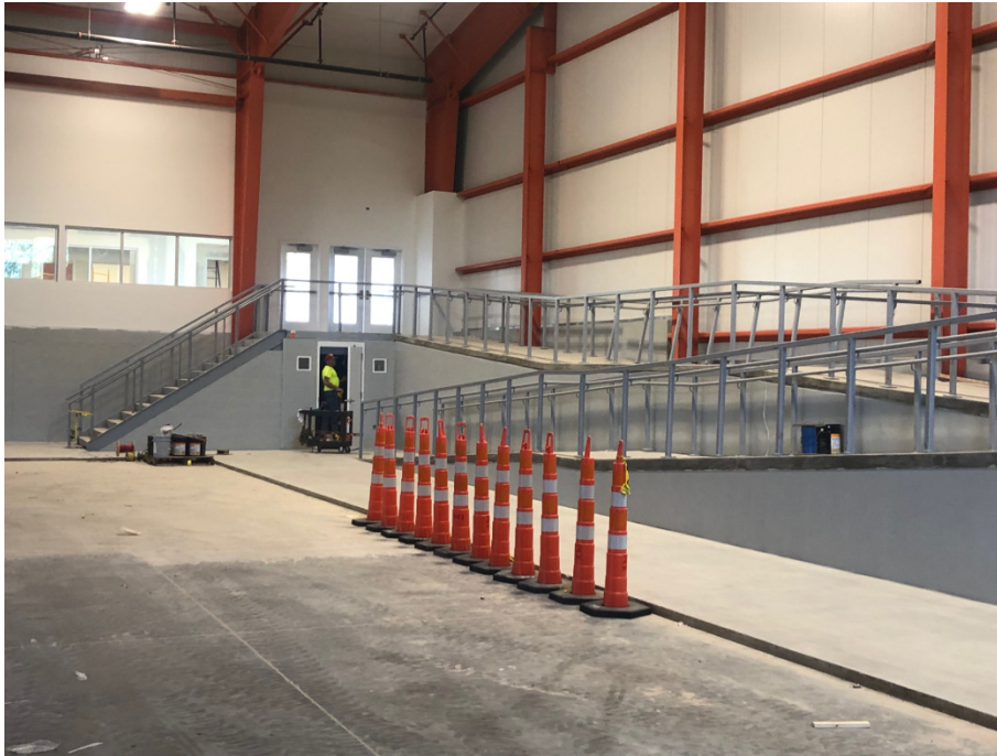
Gym Equipment and Handrail Installation