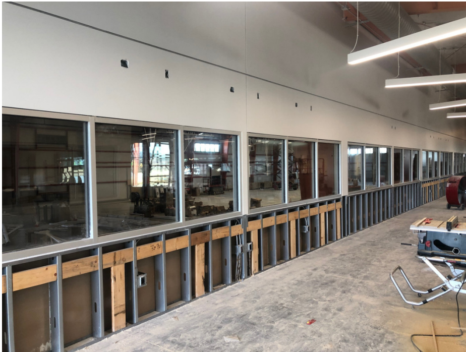
Lighting & Window Installation