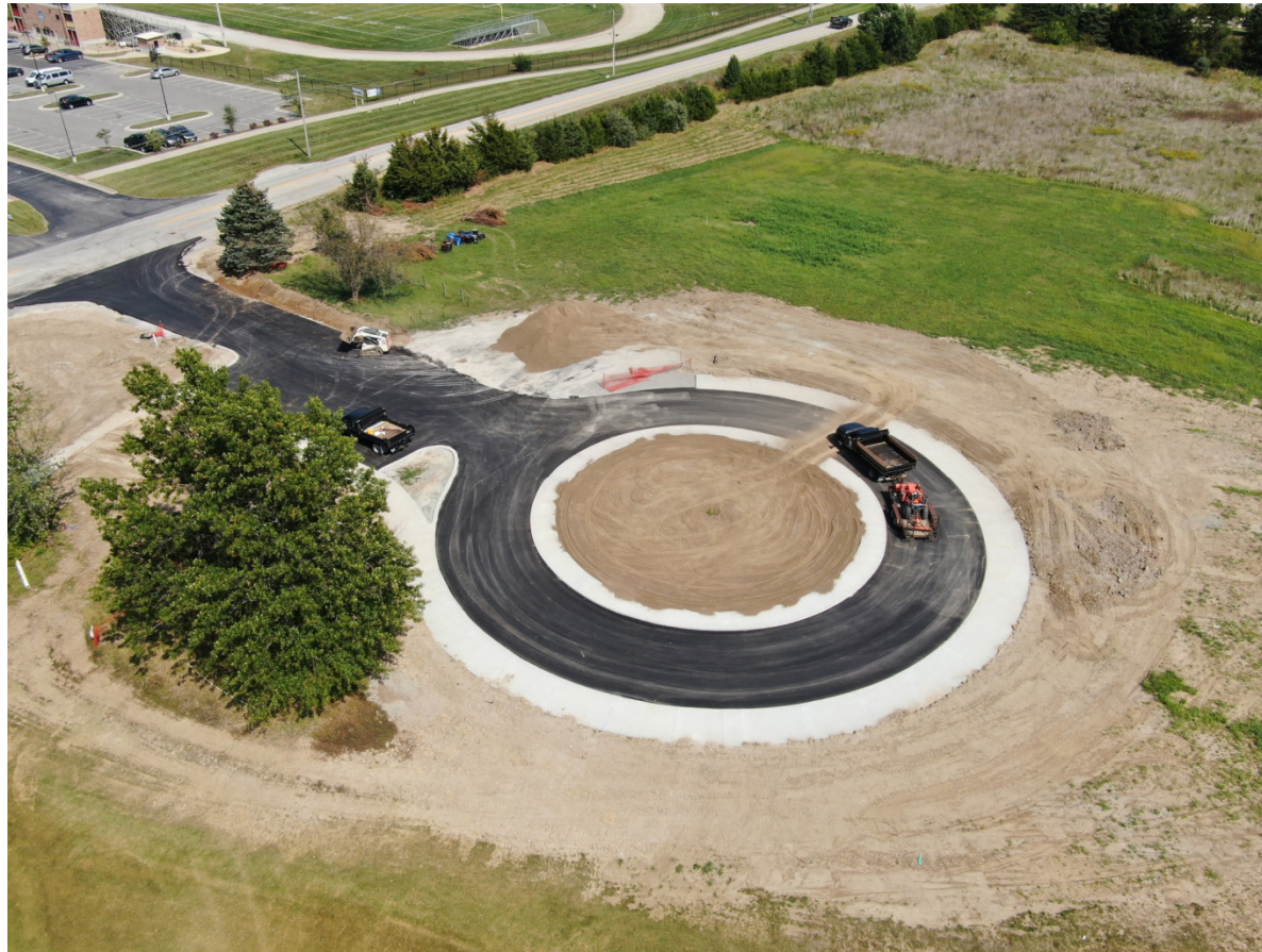
East Roundabout Construction