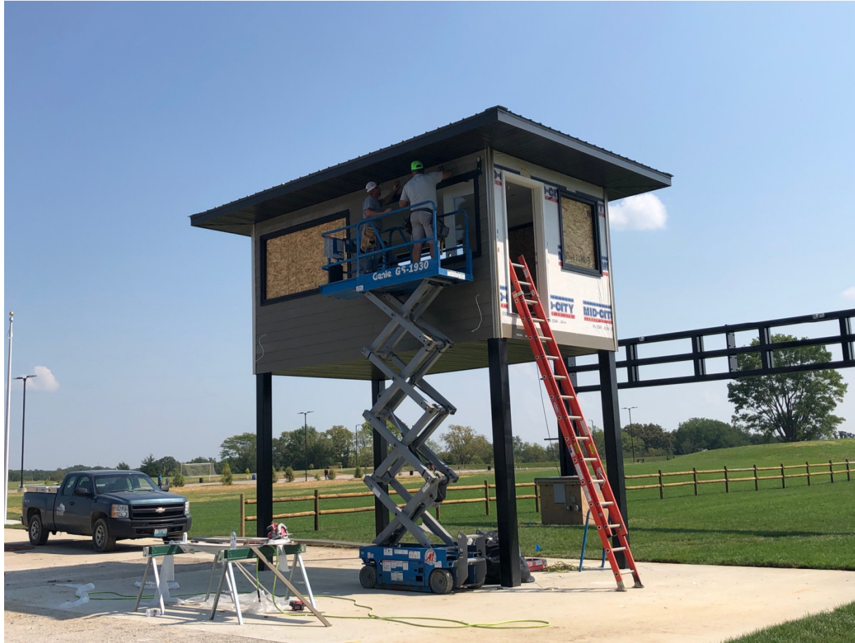
Timing Tower Construction