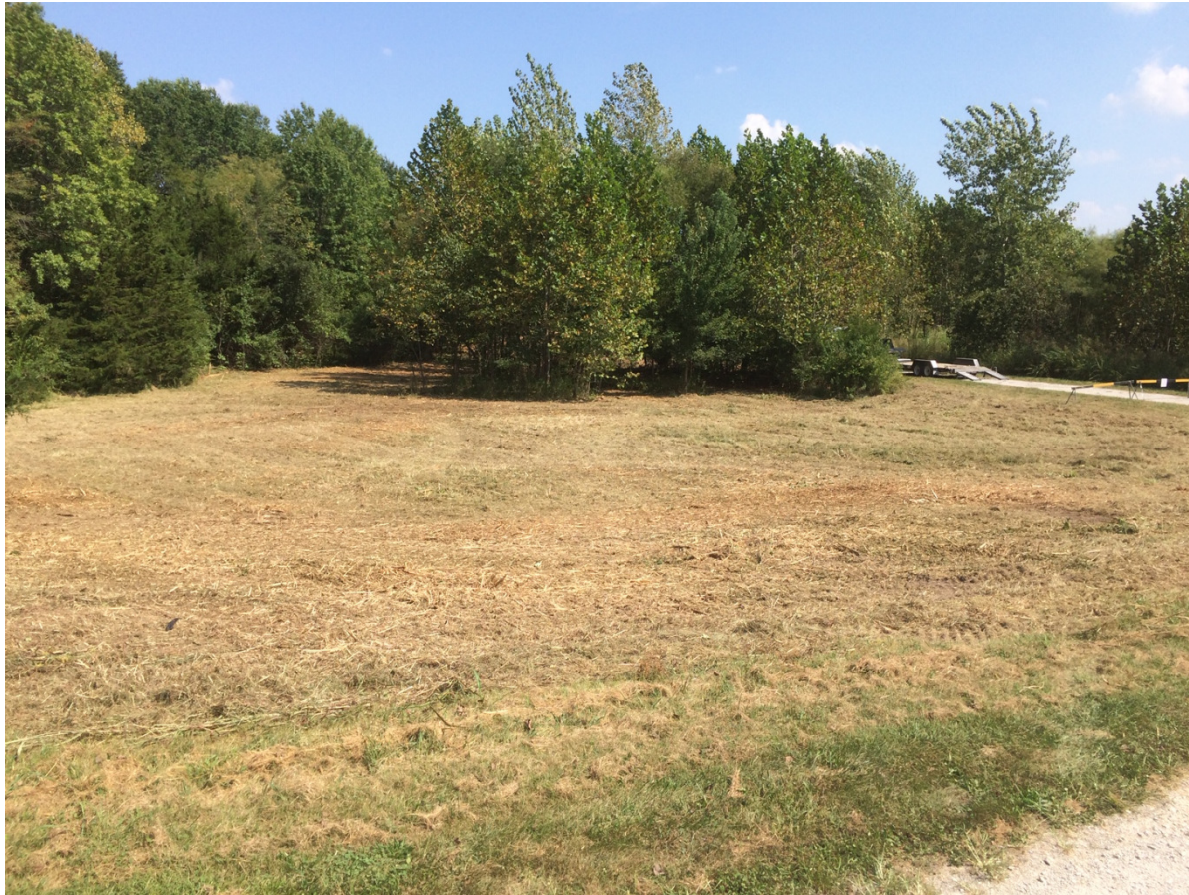
Callery Pear Removal