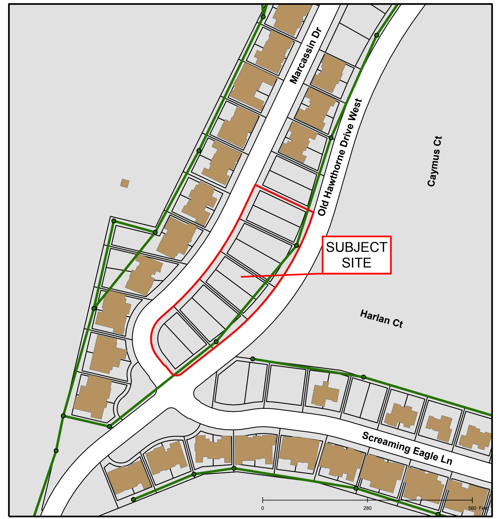
#17-136: Villas at Old Hawthorne Plat 1F Final Plat