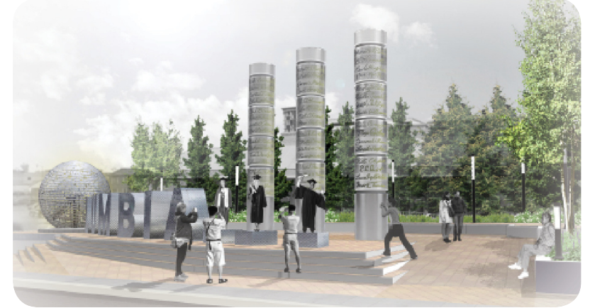
WRITING YOUR OWN HISTORY AT THE PLAZA

COLUMBIA GATEWAY PLAZA NIGHT TIME PERSPECTIVE FROM BROADWAY CROSSWALK