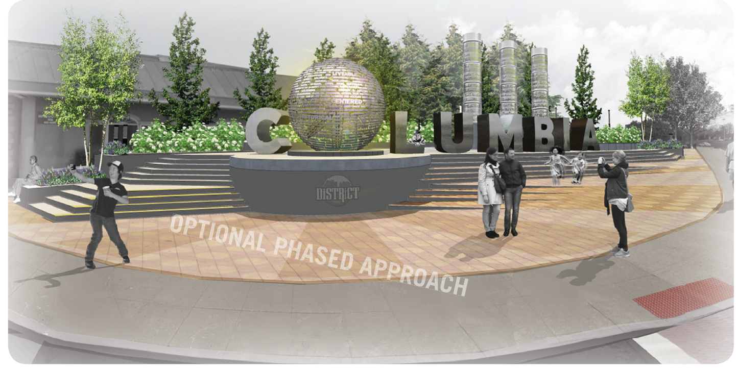
GATEWAY PLAZA: PHASE TWO Phase <u>two</u> elements would include: -Heritage Columns -Plaza Pavement -Interpretive Plaques -Steps and retaining walls Estimated Cost Phase Two: $2,125,000

GATEWAY PLAZA: PHASE ONE Phase <u>one</u> elements would include: -Columbia Letters -Sod -Earthwork -Utilities Estimated Cost Phase One: $635,000