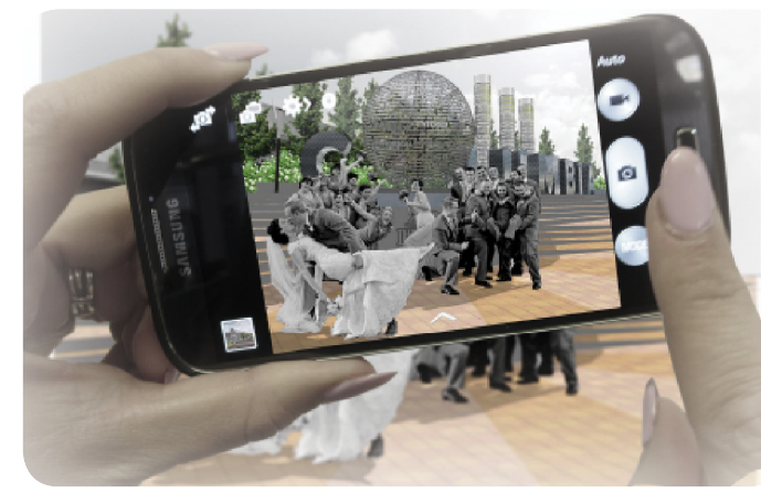
CELEBRATING LIFE MILESTONES AT THE PLAZA