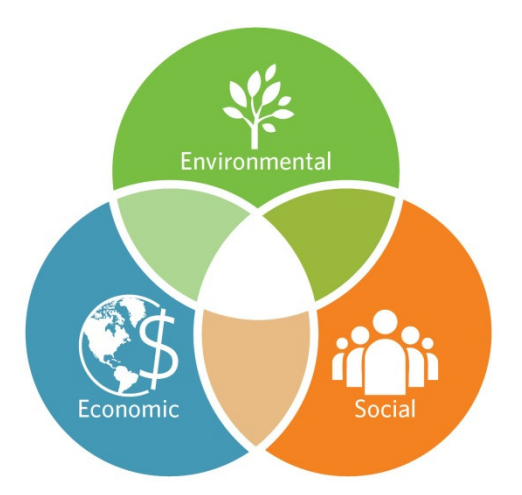
Decision Analysis Approaches like the Triple Bottom Line Evaluation will Aid in Selecting Final IMP Alternatives

Relatively simple tools, such as a multi-criteria decision analysis or the industry-standard Triple Bottom Line (TBL) evaluation, could be used for the initial IMP phase. The TBL process uses a guantification process to evaluate the environmental, social, and economic impacts or benefits of alternatives. These approaches hinge on the assignment of priorities and ranks through a collaborative exercise. Given the of community outreach importance and collaboration in the integrated planning process, these tools will likely be well suited for use in the IMP.