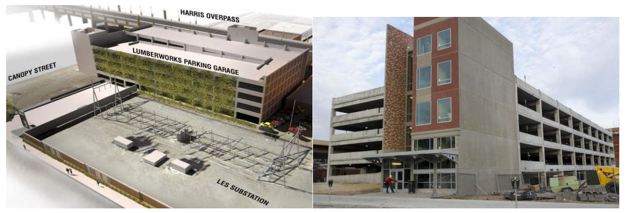
Images: Building rendering of living wall; construction of garage in progress.

Total Cost: $175,000 - Includes the frame, irrigation system and plants (covered by state stormwater grant funds)