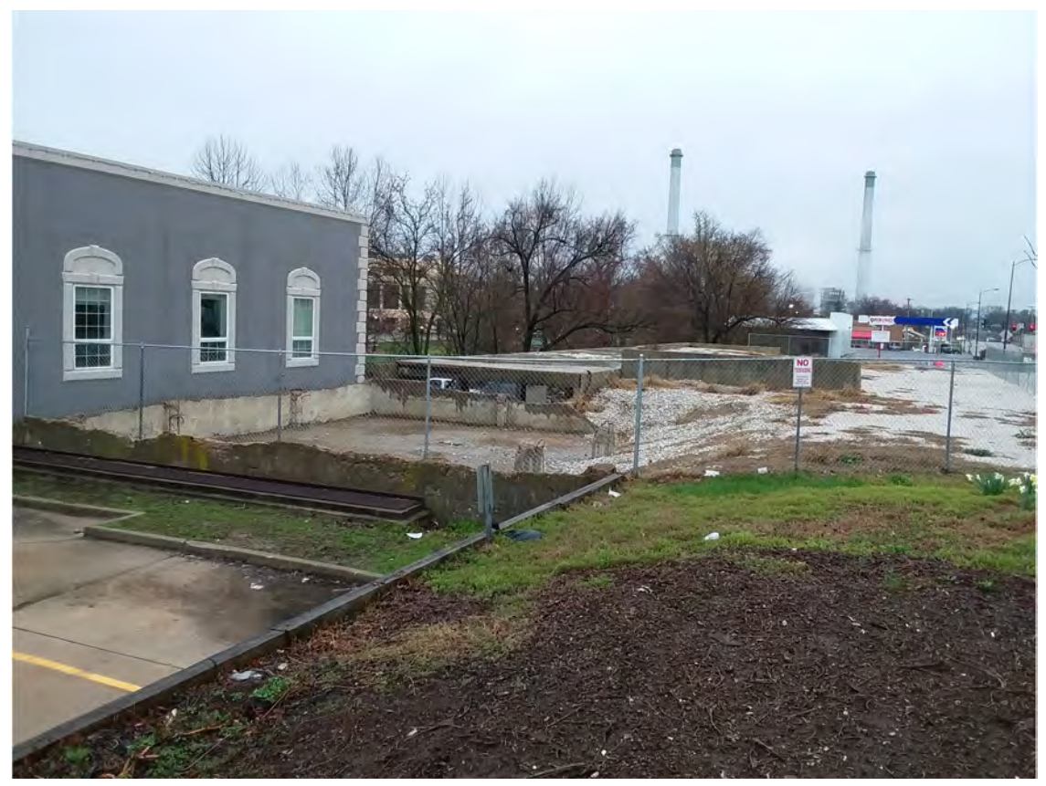
View from parking area to the south

Current photos of City owned property at the former McAdams Building