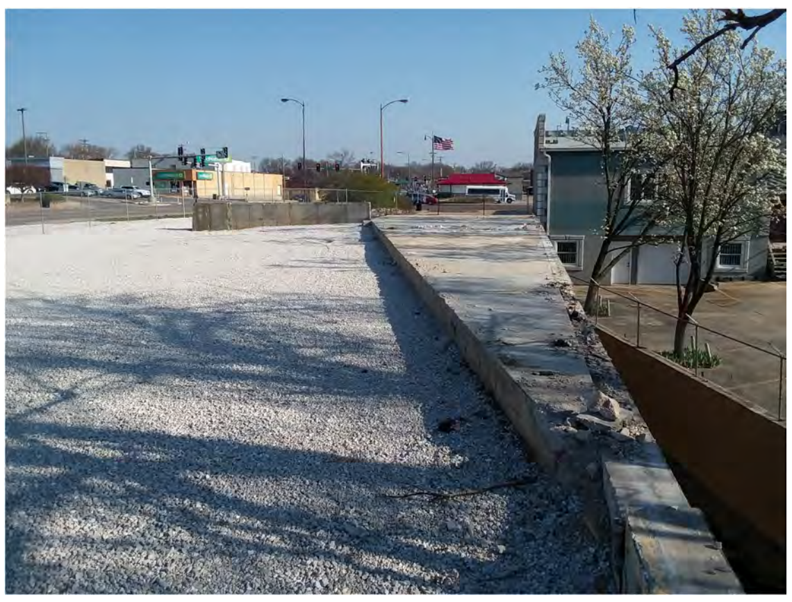
View from the Cherry St ROW to the north