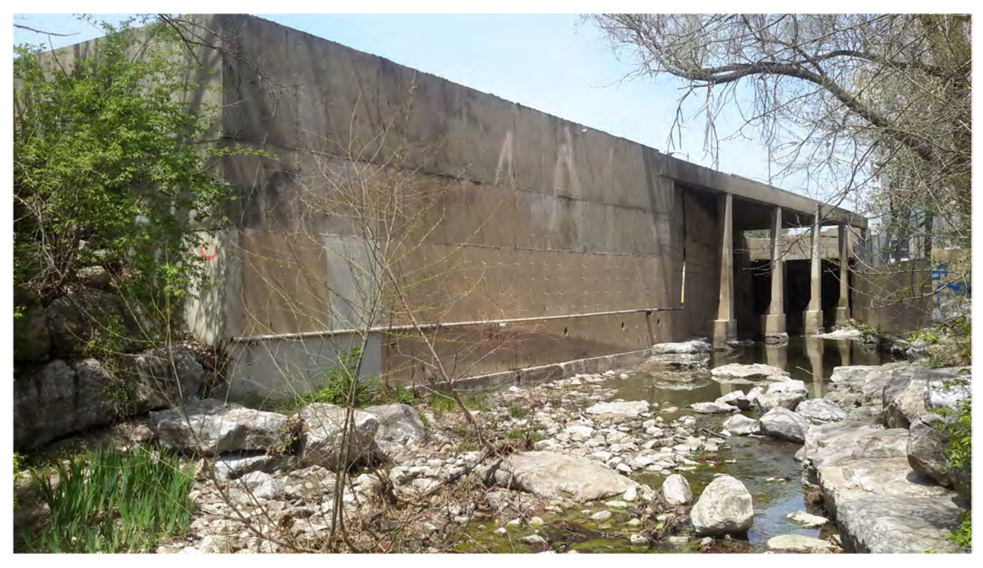
View from Flat Branch Park toward McAdams retaining wall (future creek restoration area)

Current photos of City owned property at the former McAdams Building