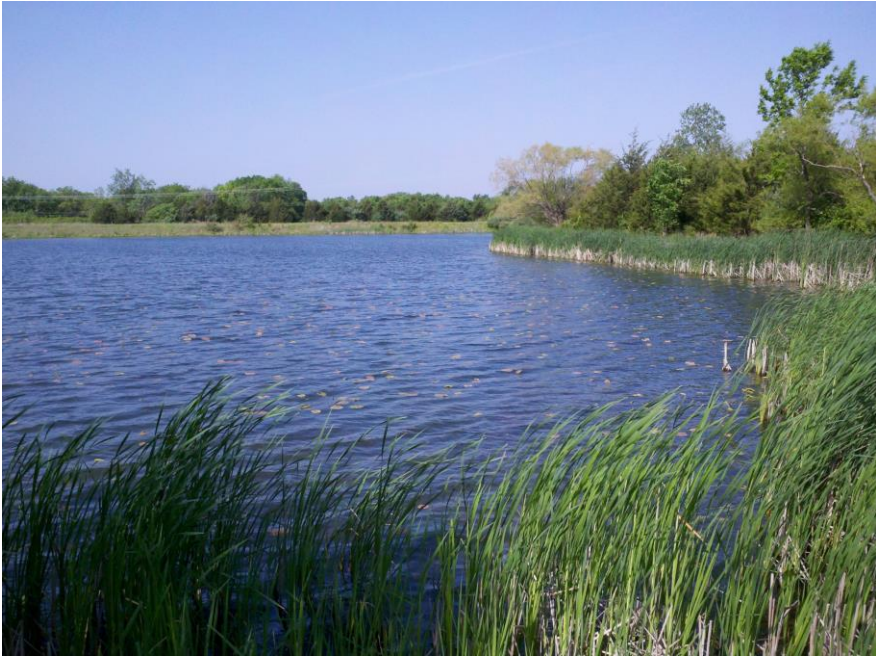
Vineyards Lake Park