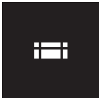
North Building Facade