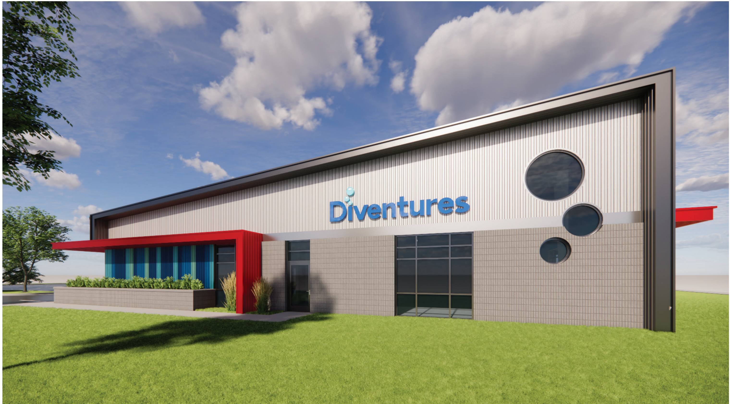
east side along capital