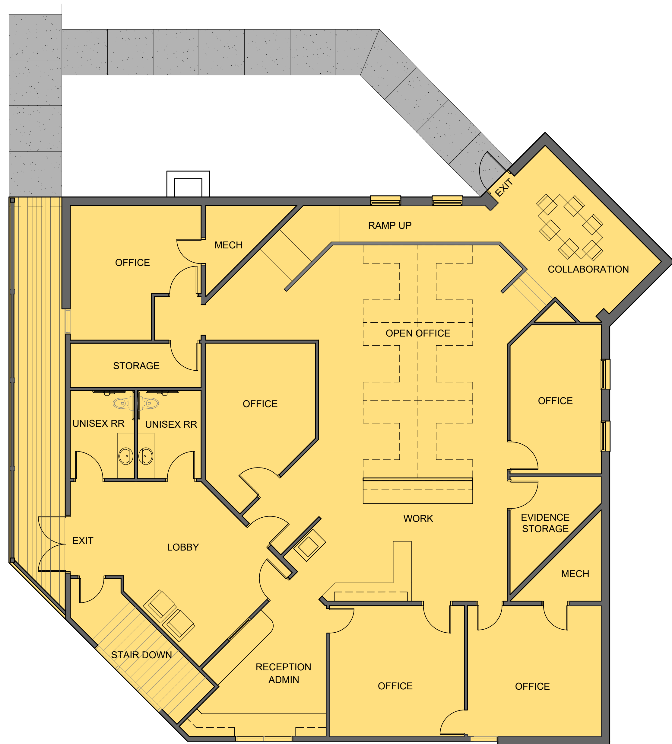
A1 FIRE MARSHAL'S OFFICE - UPPER LEVEL FLOOR PLAN NOT TO SCALE