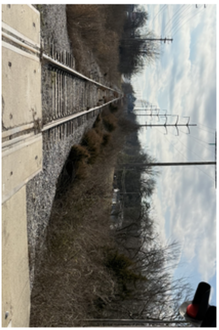
Existing tracks at East Brown Station Road

CoMo.Gov / parksandrec@comco.gov / (573) 874.7460