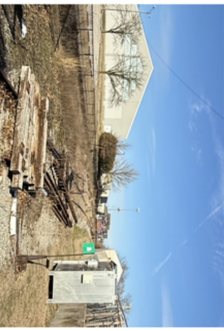
Existing tracks at Rogers Street