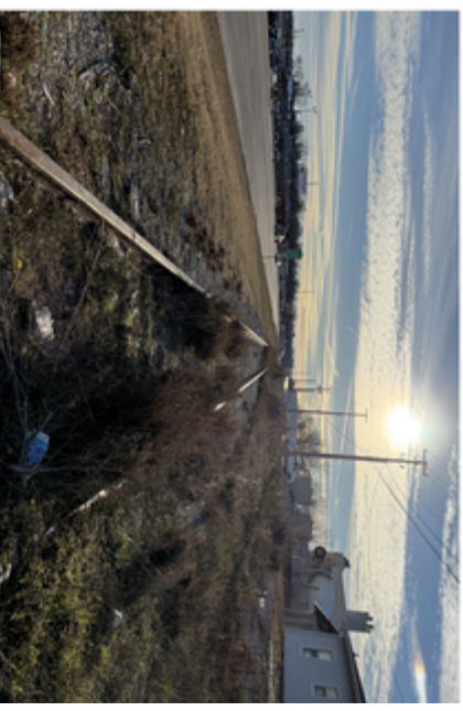
Existing tracks at 1919 Paris Rd.