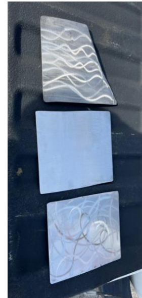
Artist rendering and selected finishing