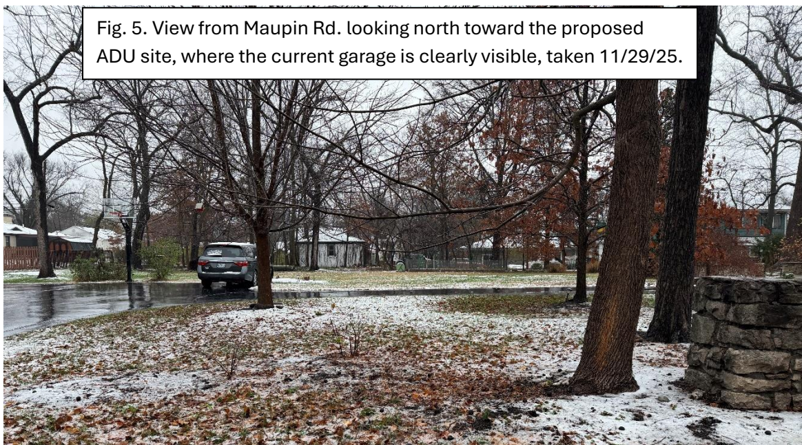
Fig. 5. View from Maupin Rd. looking north toward the proposed ADU site, where the current garage is clearly visible, taken 11/29/25.