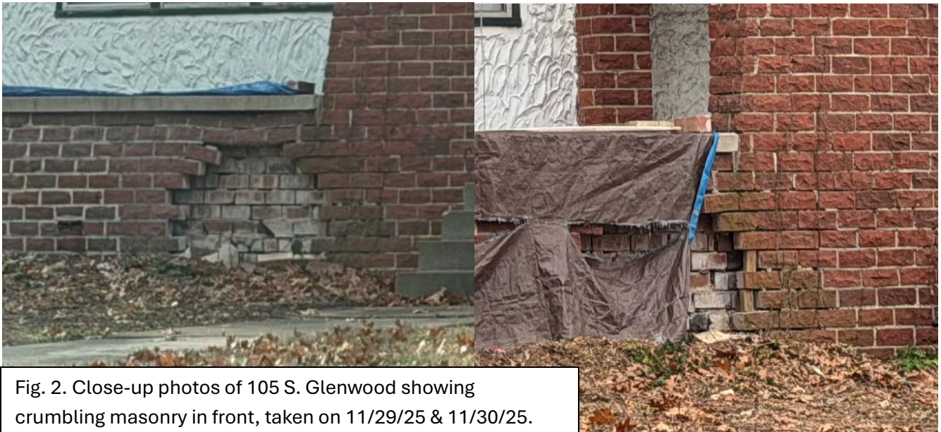
Fig. 2. Close-up photos of 105 S. Glenwood showing crumbling masonry in front, taken on 11/29/25 & 11/30/25.