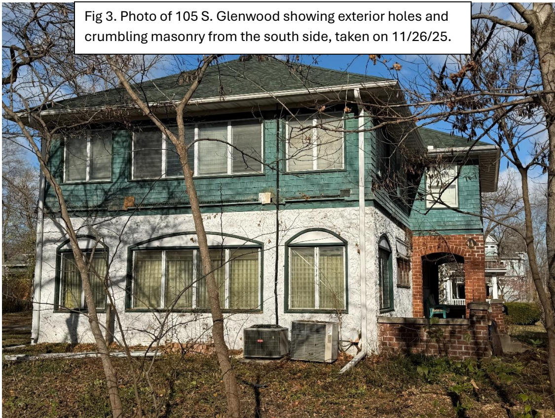
Fig 3. Photo of 105 S. Glenwood showing exterior holes and crumbling masonry from the south side, taken on 11/26/25.