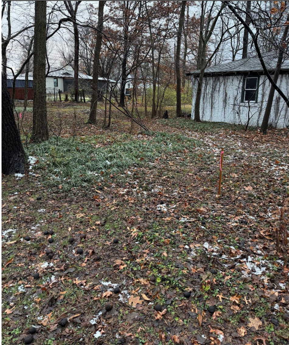
Fig. 6. View of open boundary and survey markers between 105 and 111 S. Glenwood Ave., where the white garage is the proposed ADU site, taken 11/29/25.