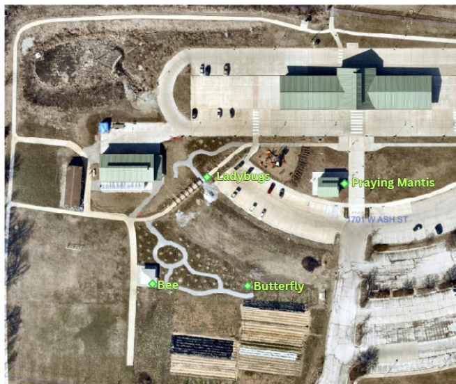
Overview of sculpture locations in park

Clary-Shy Community Park is home to the Activity & Recreation Center (ARC), the MU Health Care Pavilion, utilized by the Columbia Farmers Market, and an agriculture park managed by the Columbia Center for Urban Agriculture (CCUA). The Columbia Parks and Recreation Department, in collaboration with CCUA, have proposed a series of insect sculptures to be integrated into the built environment of the park. The sculptures would represent a variety of native insects as well as add artistic interest to the various buildings and structures throughout the park. The sculptures are to be designed and created by local artist, Stephen Feilbach.