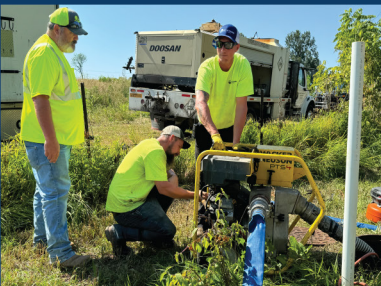
Provide sustainable services for the future

The photos below show some of the projects implemented by the City during this 5-Year IMP Action Plan.