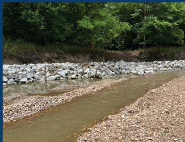
Stabilize stream channels to reduce sediment discharges