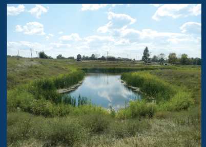
Implementing stormwater runoff treatment