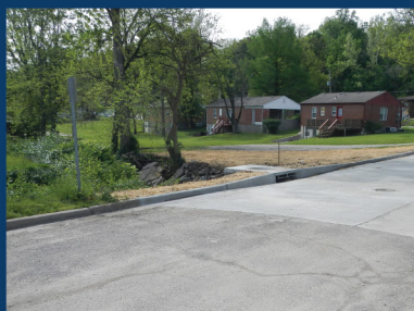
Address areas of flooding to reduce safety concerns