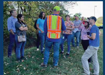
Enhance public education and outreach