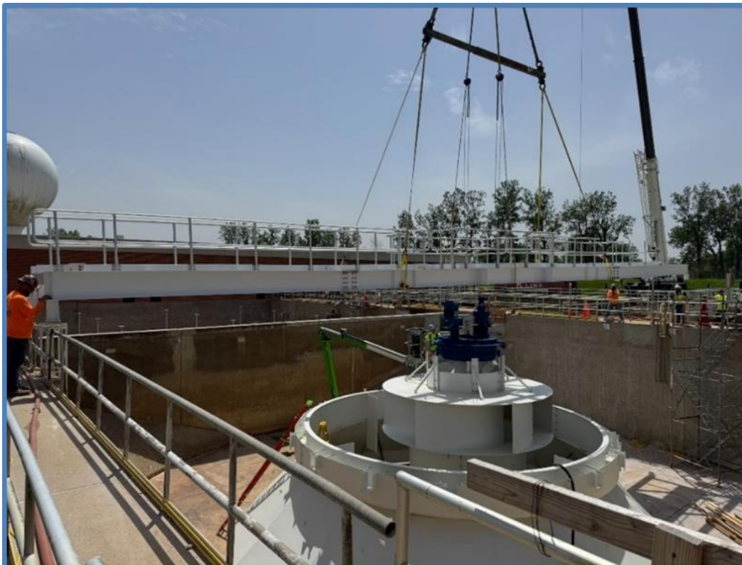
Figure 1 – Clarifier 3 Bridge Installation