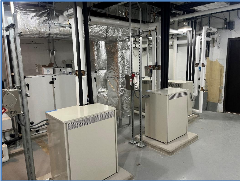
Figure 4 – New HVAC system (Basement of Operations Building)