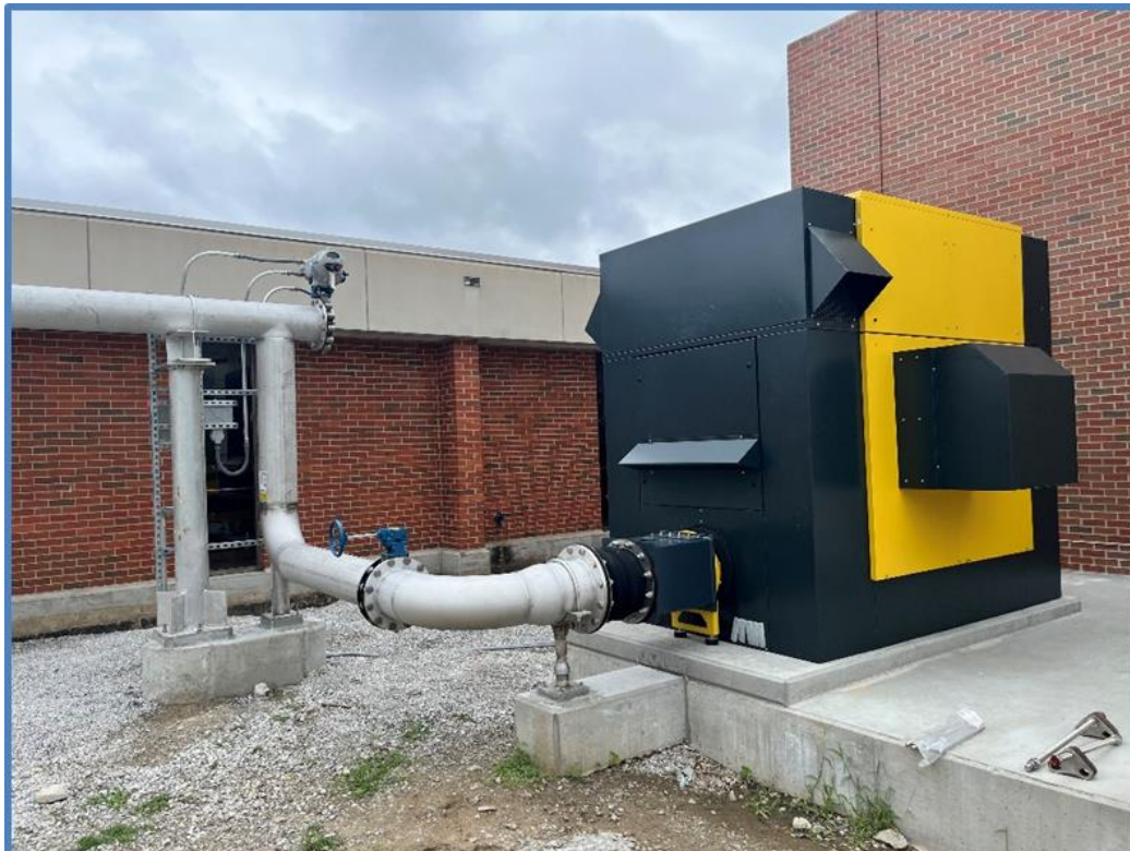
Figure 3 – Filter Blower