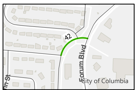
Item 42: Sidewalks on the North Side of Mills Drive between Highridge Drive and Forum Boulevard