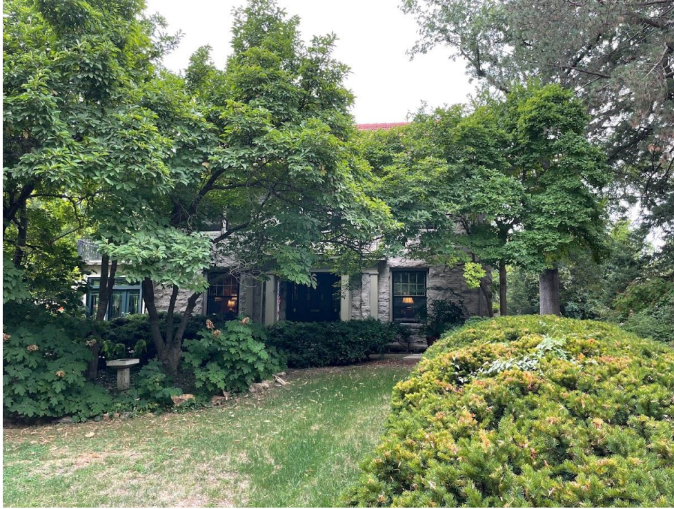
Back Carriage House