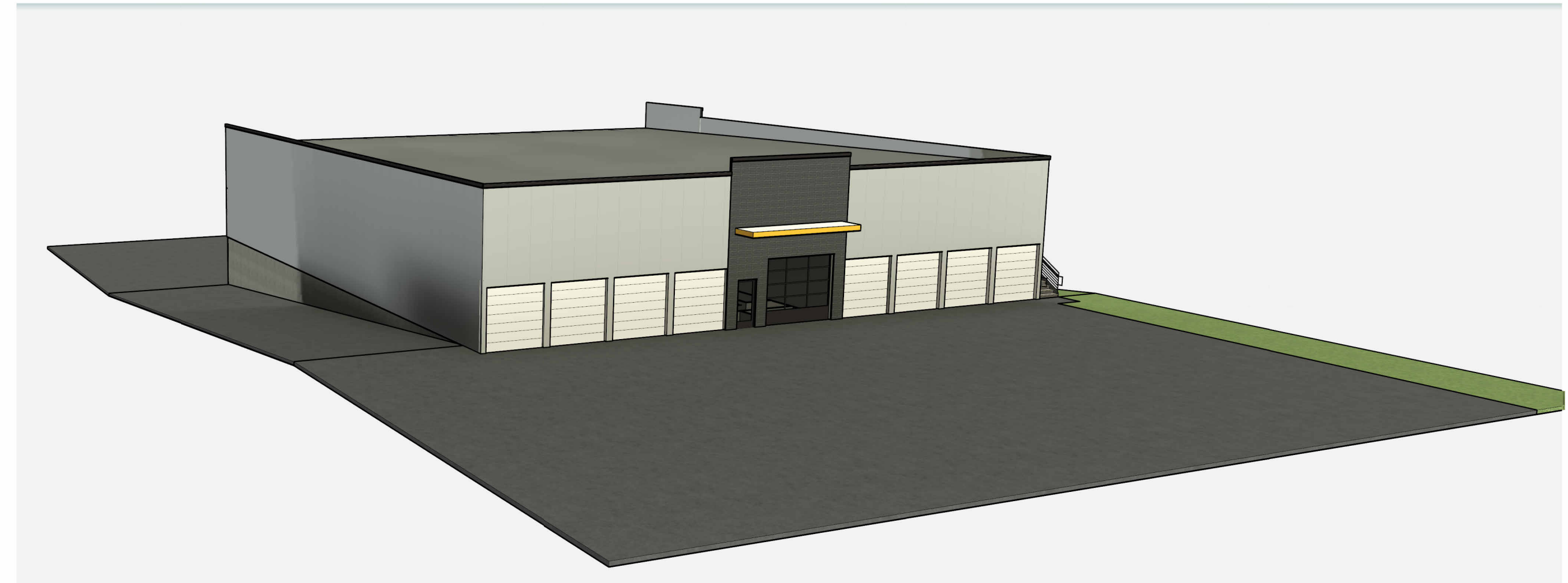
2 SOUTHEAST VIEW