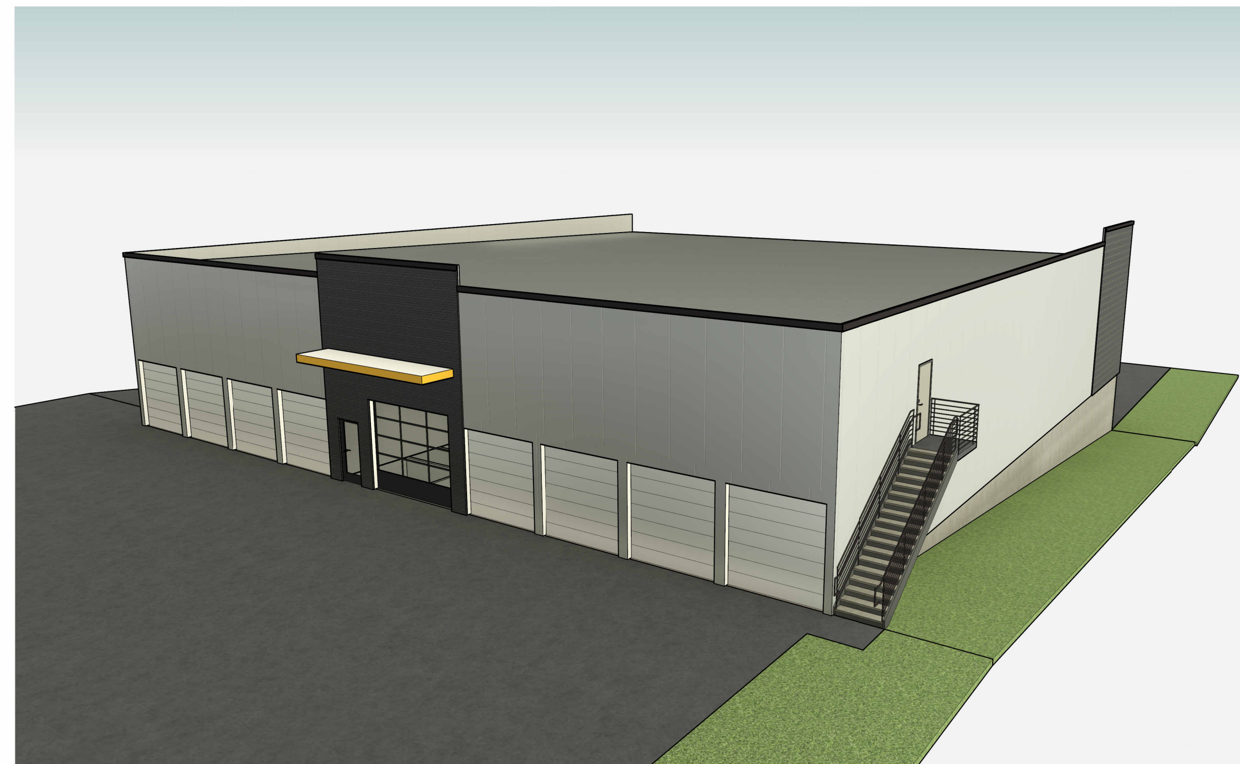
3 NORTHEAST VIEW

STORAGE MART - COLUMBIA COLUMBIA, MISSOURI