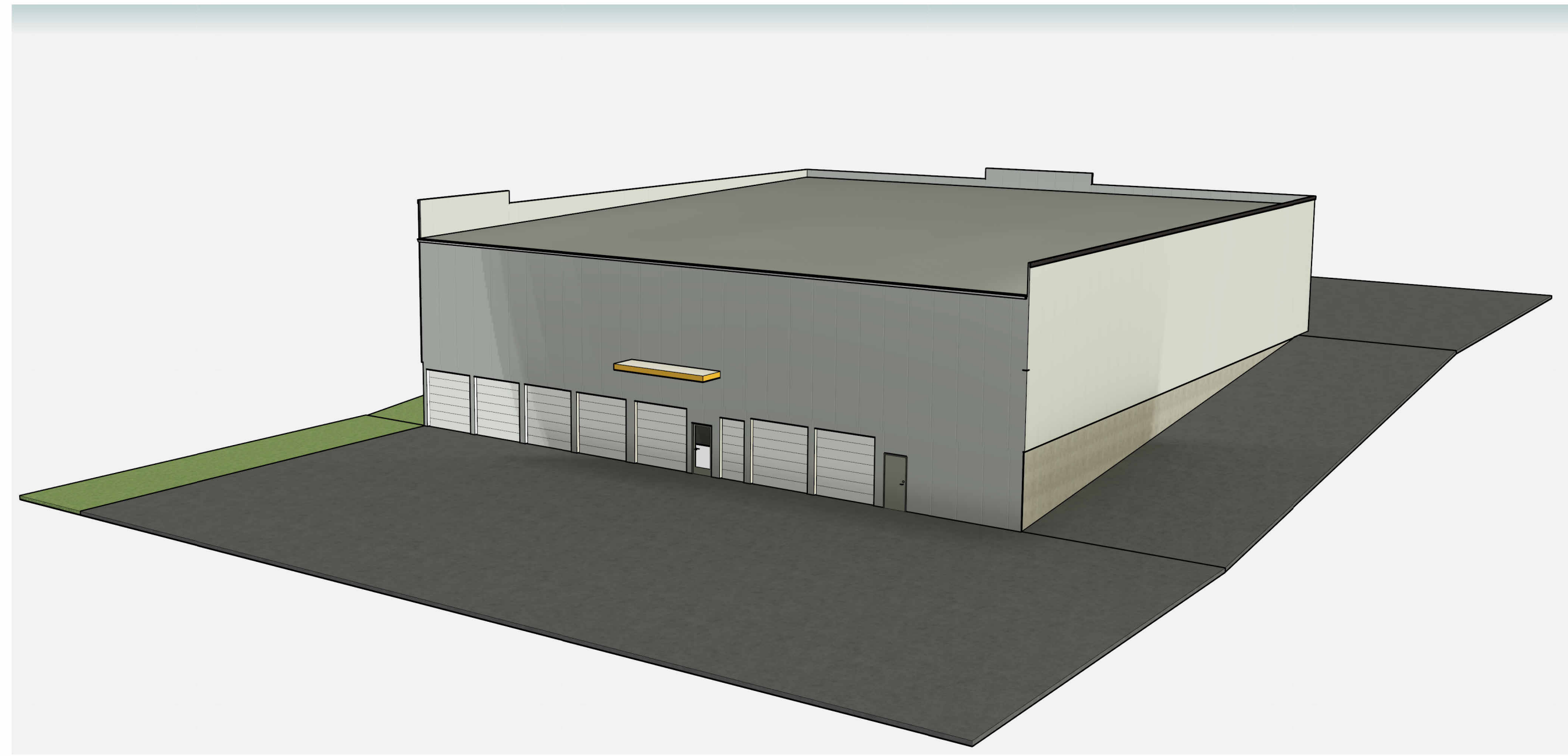
1 SOUTHWEST VIEW