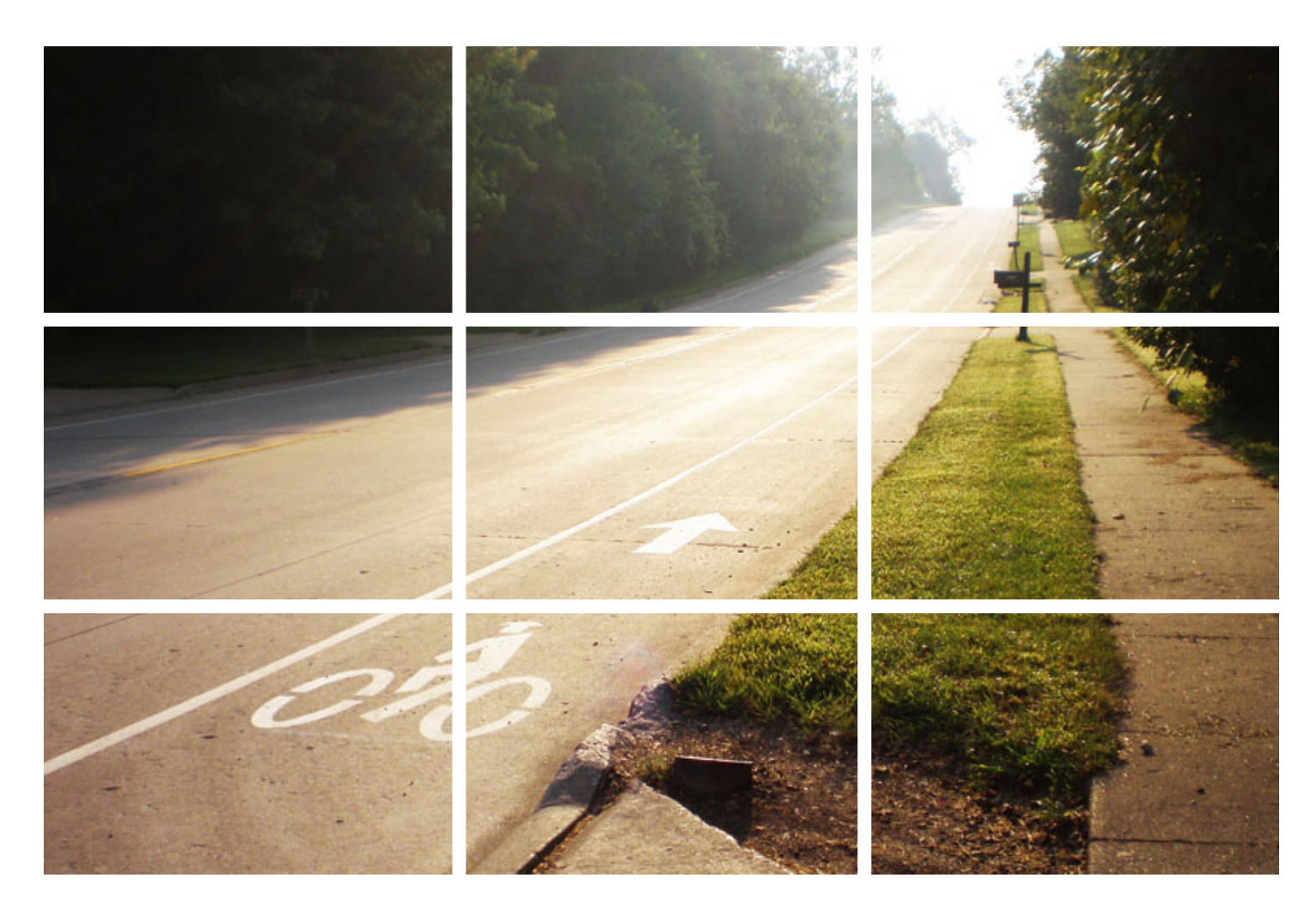
2012 Sidewalk Master Plan Update City of Columbia, MO

Approved by the Columbia City Council April 1, 2013